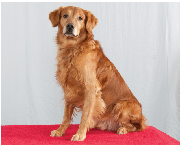
Photo: Top Obedience Dog, Golden Retriever GMOTCh. Rideauview's Bright Horizons - courtesy of Dean Dennis Photography.

Congratulations to all our 2013 Top Dogs!