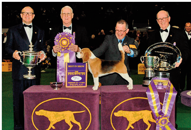
Miss P - GChX Tashtins Lookin For Trouble.

It is with immense pride that the Canadian Kennel Club congratulates our Canadian purebred dog winners at the 139th annual Westminster Kennel Club Dog Show and all the hard-working breeders, owners and handlers who contributed to their success.