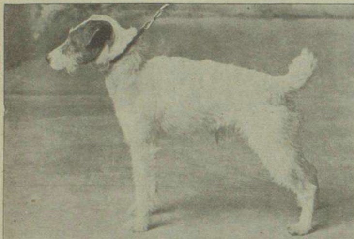
Norfolk Brisk (Late Endcliffe Brisk)

1st Puppy, New York, 1895. 1st, Open, Detroit and Chicago. Specials for best in Open Classes, Chicago. Two or three 1sts, Toronto. 1st Bridgeport, 2nd Providence, 1895. 1st New York, Detroit, Chicago and St. Louis, 1896.