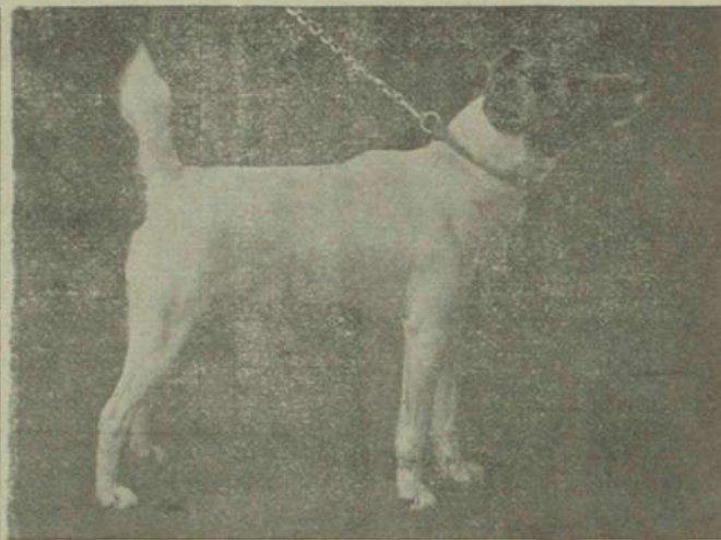
Norfolk Joker (Late Cambridge Joker)

Winner of 1st in Open Class, Toronto, 1895, and Special for the best Smooth Terrier in the Show, and also two other Specials, beating the following dogs: Raby Reckun (winner of 60 1sts in England), Blemton Firebrand, Beverwyck Kingpin, Von Voit, Lansdown Poverino, etc., etc.