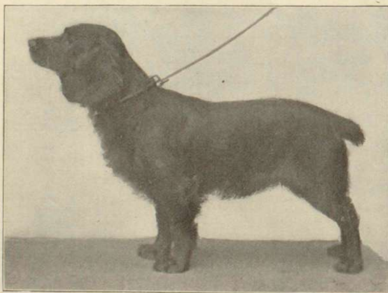
RED COCKER DOG, "RED COAT"