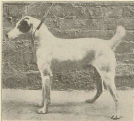
SMOOTH FOX TERRIER DOG, "ECLIPSE TARTAR"

First and Special, Burnly, England Second, Open Class, Worsly, England &c., &c.