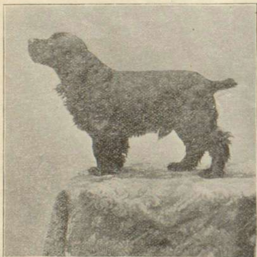
Belle Isle Kennels, Detroit, Black Cocker Spaniel OMO (A.K.C.S.B. 42750) Ch Black Duke - Ch Baby Ruth