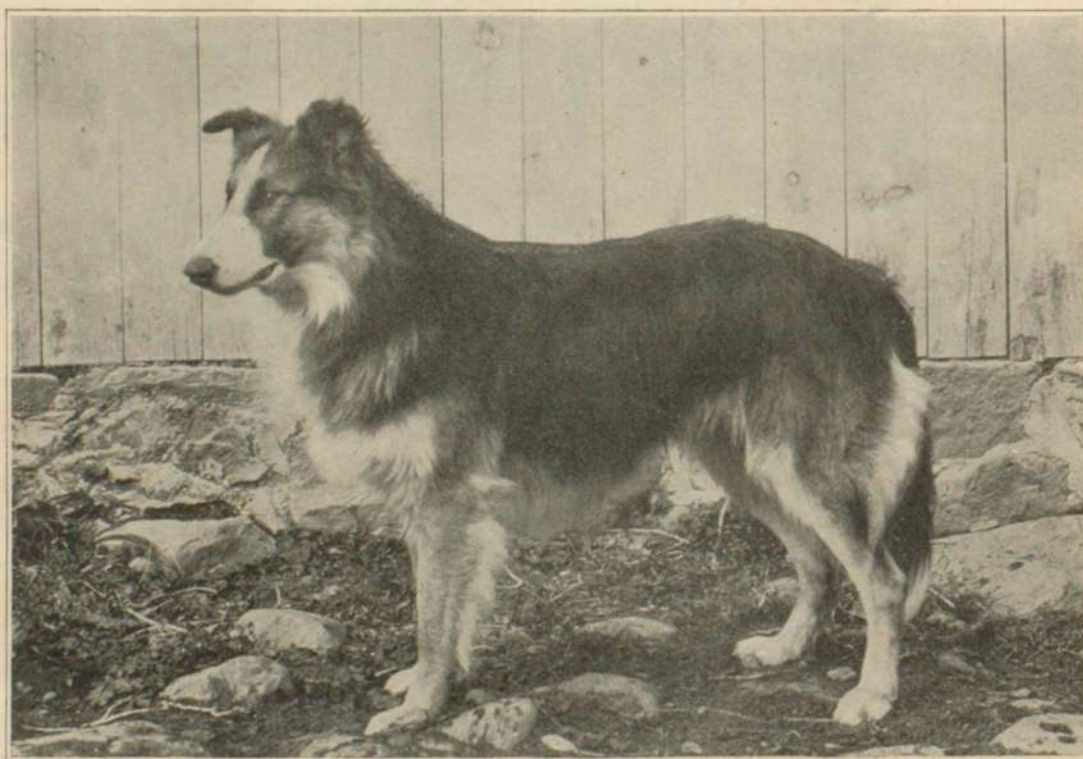
Brookside Farm Kennels, Newburgh, N.Y. BROOKSIDE BLUCHER, A.K.C.S.B. 42005.

1st Special and Medal, Toronto. 1st, Montreal.