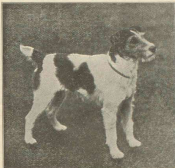
CH. GO BANG.