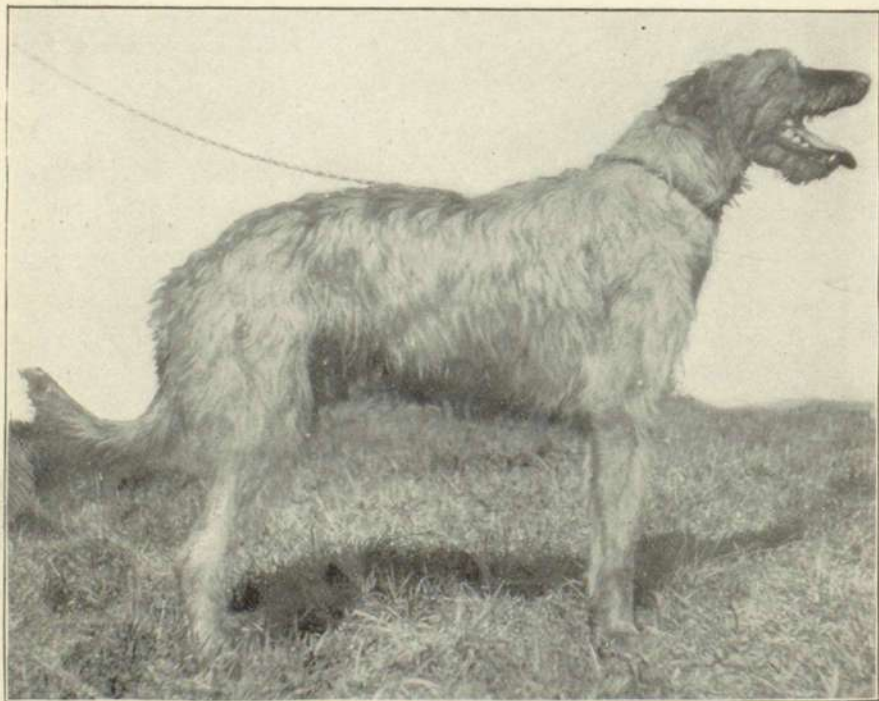
DEERHOUND, "SCAMP," No. 5429.