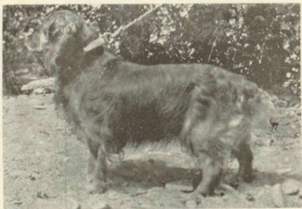
GOLDEN ROD, 1st Limit, Gore Kennel Club Show.