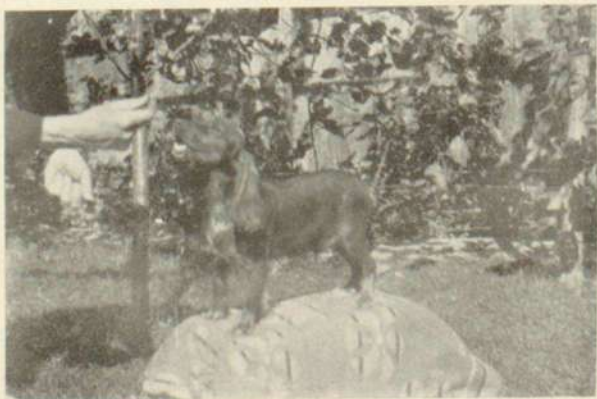
UNION JACK. 1st Novice, Gore Kennel Club Show.