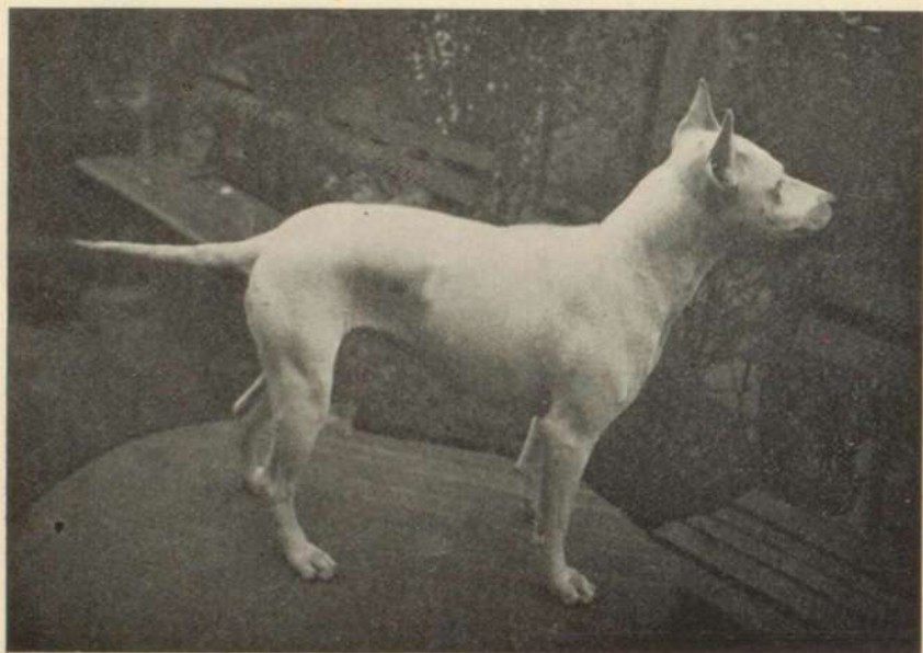
PRINCETON BELLE, A. K. C. S. B., 64,740.

English hound type, so called, with long head and long ears and body as long as it was possible to get. Like many fancies in England, it was carried to extreme; in fact, one might remark, the longitude of the breed was given far too much latitude. Then there is the so-called Terrier type, a German dog, which is a neater, more sprightly animal, with shorter ears, set higher, not so long in the body and seemingly altogether better adapted for