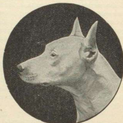
CAPTAIN WOODCOTE A. K. C. S. B., 64,738.

April 20—Tooney, sire Ch. Princeton Monarch, ex Compassion, property of