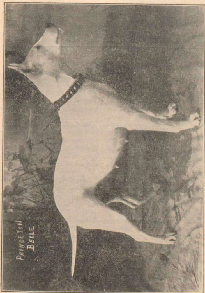
A BONNYBRED MATRON "PRINCETON BELLE"