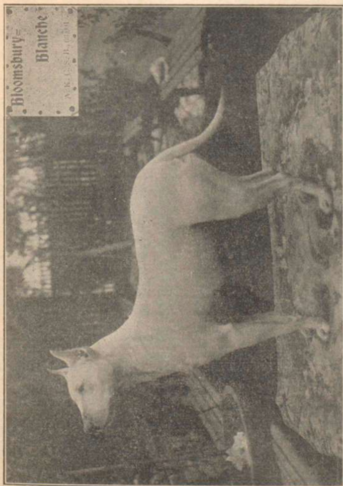
A BONNYBRED MATRON "BLOOMSBURY BLANCHE"