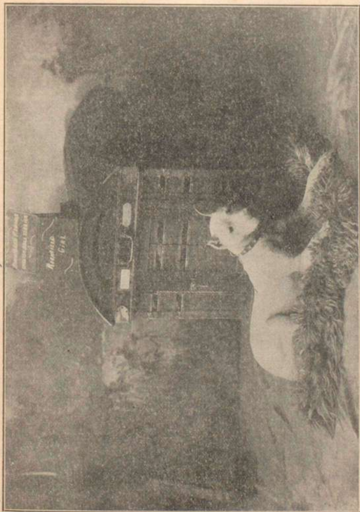
A BONNYBRED MATRON "RICHFIELD GIRL"