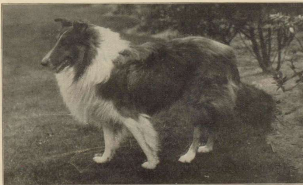
THE NOTED COLLIE, CHAMPION SQUIRE OF TYTON.