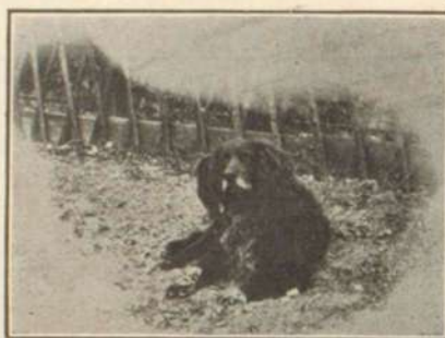
"Now I'm old and lame—and under my jowls, the brown is turning grey."

A painless death for a faithful friend— and a grave near a strip of fen— A wooden box—and a brown head lain on a pillow by loving hand— And some blinding tears are the burial