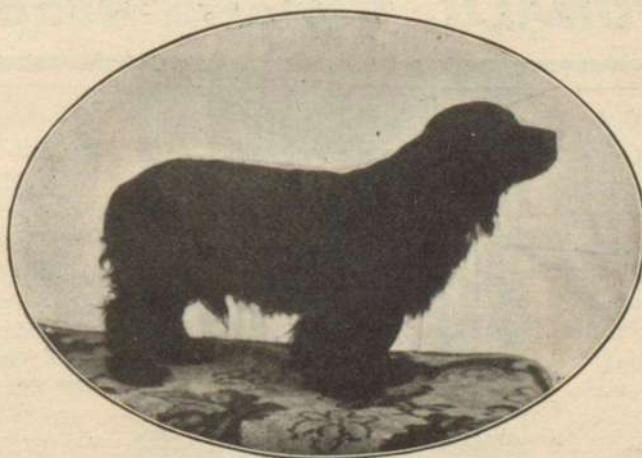
Black Cocker Jesmond Promise.