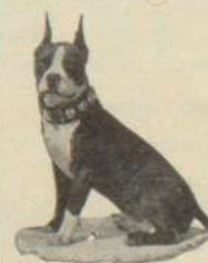
Boston Terrier Othello