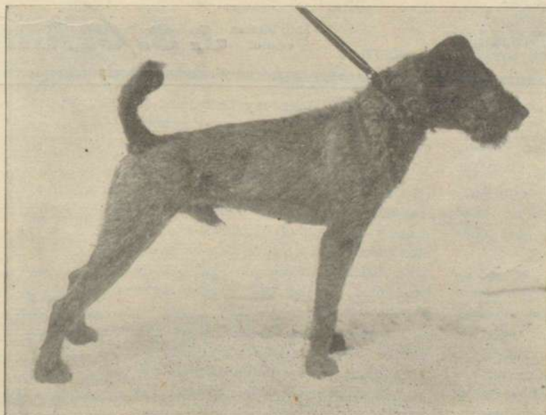
The Irish Terrier Champion Drumclaph Fairplay, whose sudden death was noted in June CANADIAN KENNEL GAZETTE.