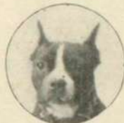
brindle in color, stylish and trappy, with correct markings, and has a very fine double screw tail. He is young and a sure sire.