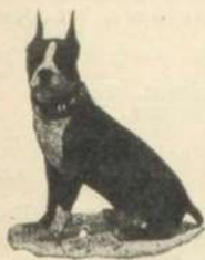
Boston Terrier OTHELLO A good winner at Buffalo