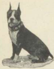
Boston Terrier OTHELLO