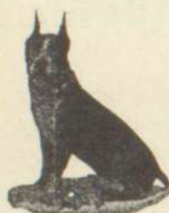
Boston Terrier OTHELLO A good winner at Buffalo