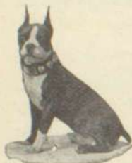
Boston Terrier OTHELLO