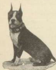
Boston Terrier OTHELLO A good winner at Buffalo