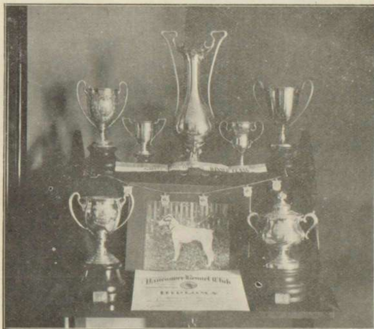
Cadger of Oaks Daddy