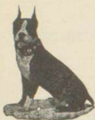
Boston Terrier OTHELLO A good winner at Buffalo