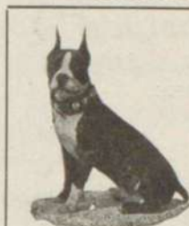
Boston Terrier OTHELLO A good winner at Buffalo