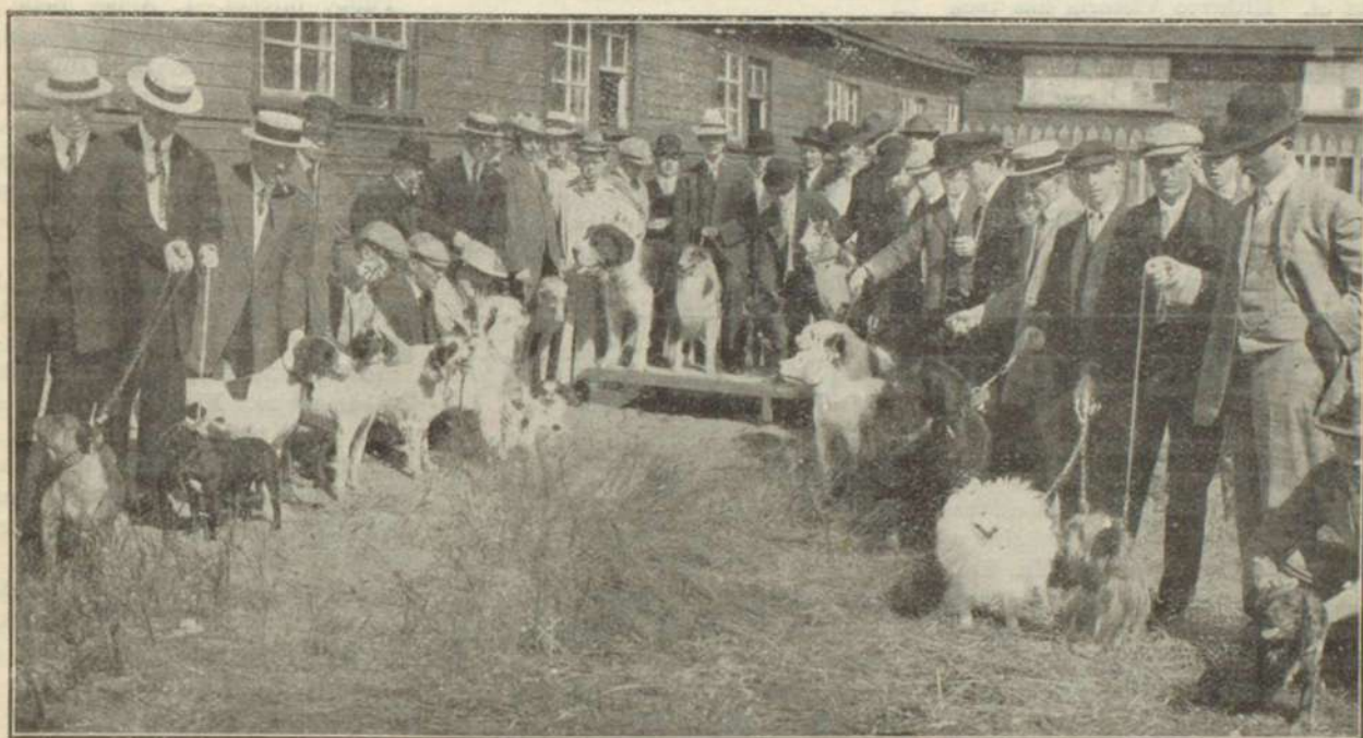
JUDGING FOR THE CHAMPIONSHIP AT WINNIPEG IN 1909.

Wm. Cooper & Nephews, Toronto, offer their famous disinfectant and wash, Lavene, through Gazette columns. See their ad. for prices.