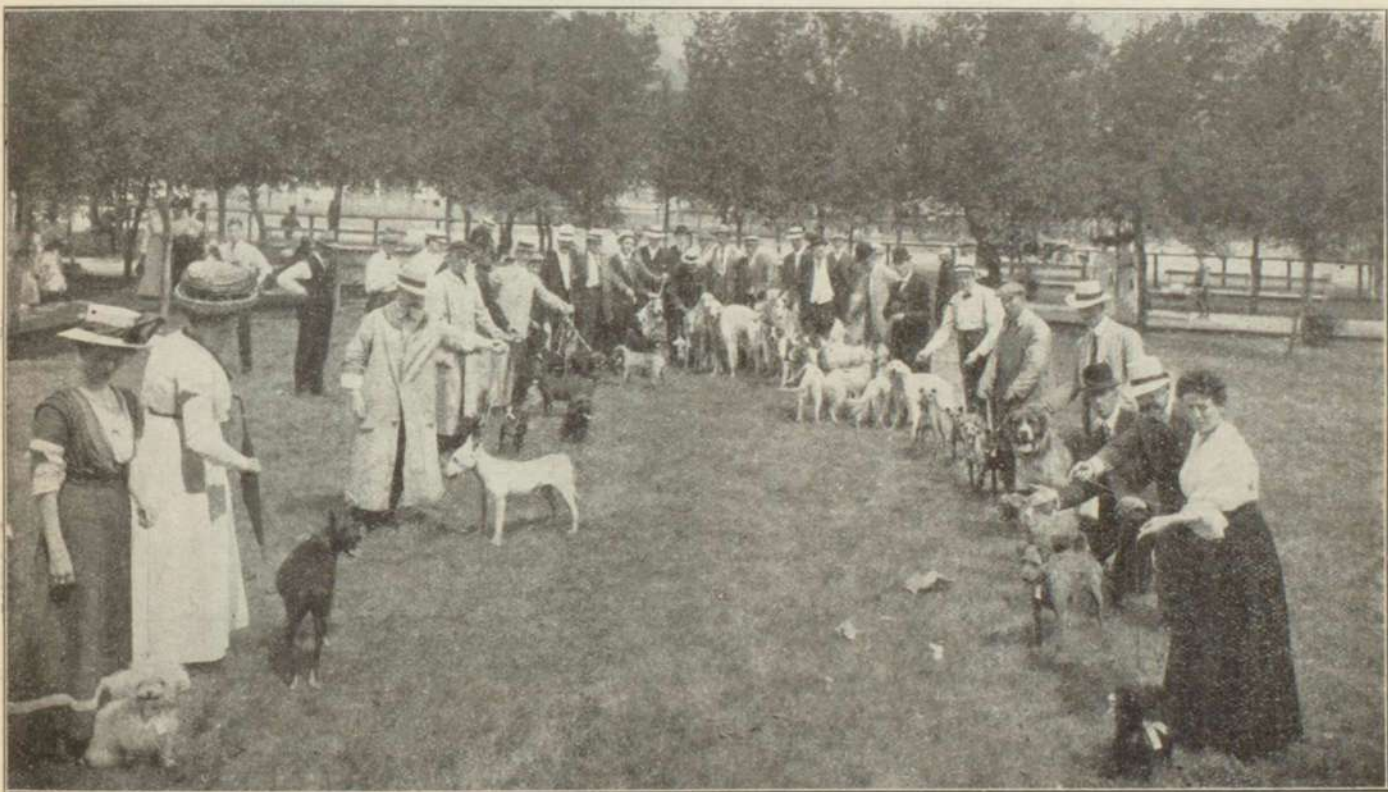
WINNERS, WINNIPEG INDUSTRIAL EXHIBITION, 1910.