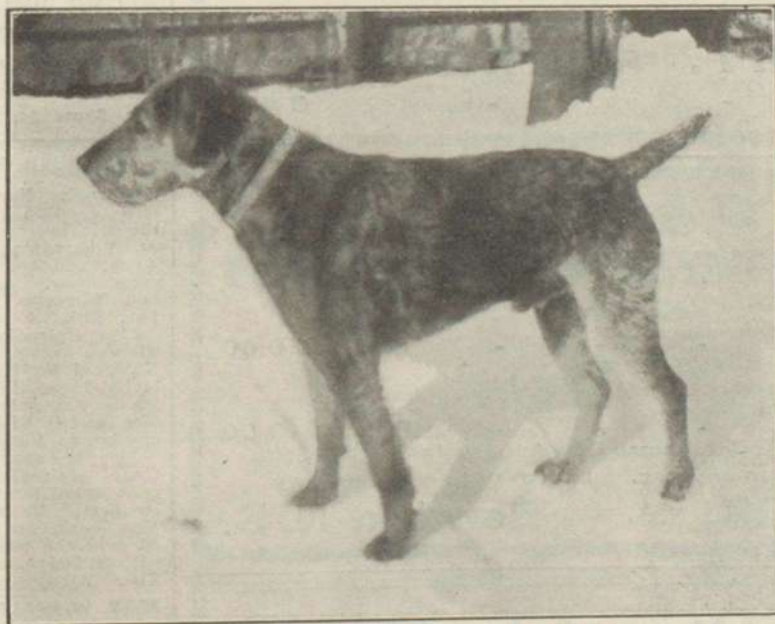
THE WINNING AIREDALE FONTMEL CHIEF, C. K. C. S. B. 10879. Owned by Fontmel Kennels, Toronto.