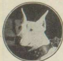
DUVAL KING C. K. C. 11245