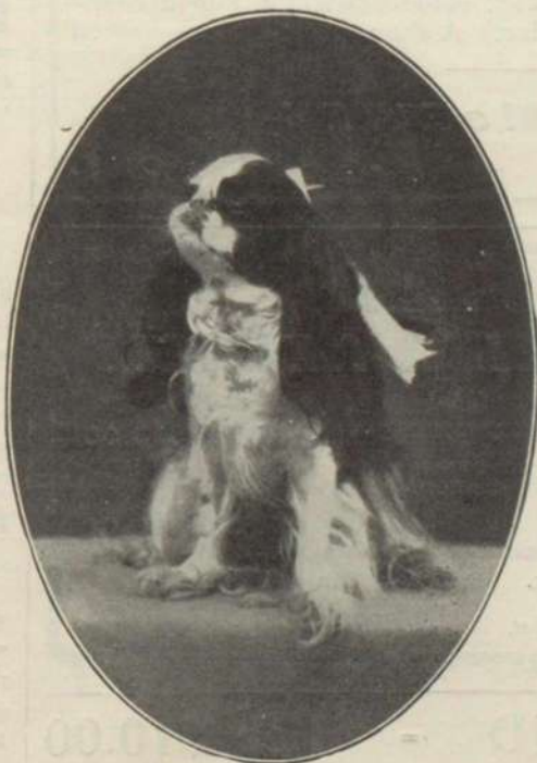
THE ENGLISH WINNING TOY SPANIEL, CASINO GIRL.