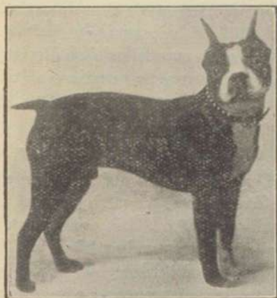
Ch. Dallen's Surprise

Special mention might be made of Revillo Peach, sire of Ch. Yankee Doodle Did-Broker, a most valuable dog at stud in his time. Major Delmar, probably the