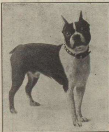
CH. DALLENS SPORT