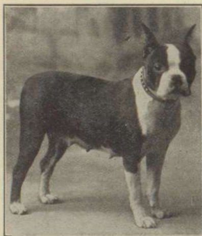
Yankee Doodle Darling

There was nothing classic in Bull Terriers, prominent skulls and weak fore faces being predominant. A dog escaped from the hall before the judging, the classes