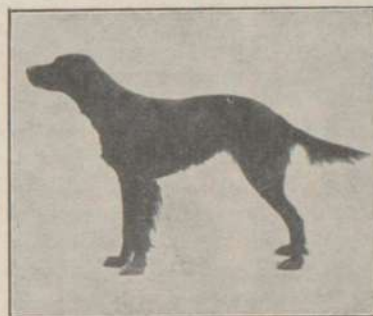
Ch. Rhuminantly Rhu