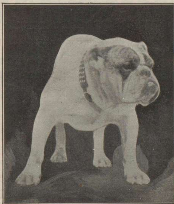
Champion Cheetham Squire, C.K.C.S.B. 12307.