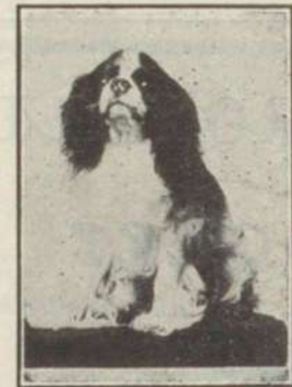
CELAMO BERTONE 9 13 stock

Celamo Kennels 19 Sanford St., Rochester, N.Y.