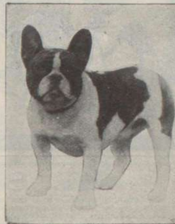
Ch. Charlemagne of Amersham