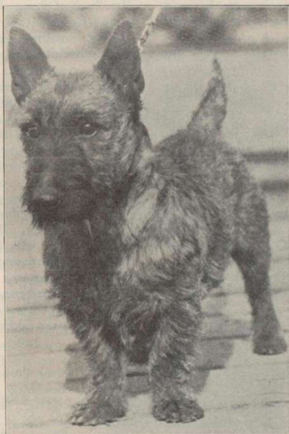
CHAMPION BRUNSFORD BATTLER

While we think of it here are a few other Western brevities that will show the trend