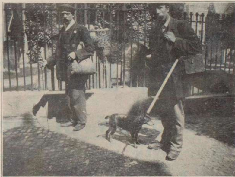
At the present rate of increase, it will doubtless not be long before professional rat-catchers with trained ferrets will go about ridding houses and farms of rats at so much per head.