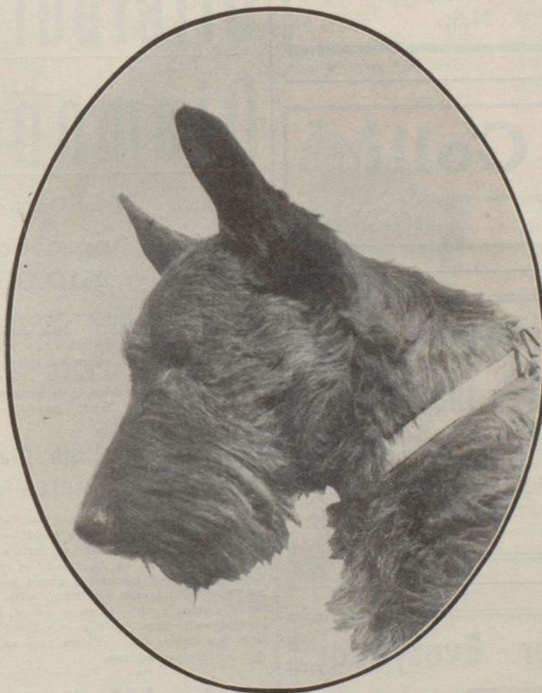
The Scottish Terrier, Grafton The Rodnim. Bred by Grafton Kennels, North Grafton, Mass. Best puppy and best bred by exhibitor, Boston, 1913. Sired by Grafton The Farmer ex Grafton The Fencer, both also home bred ones, as was Farmer's dam, Ch. Grafton Crex