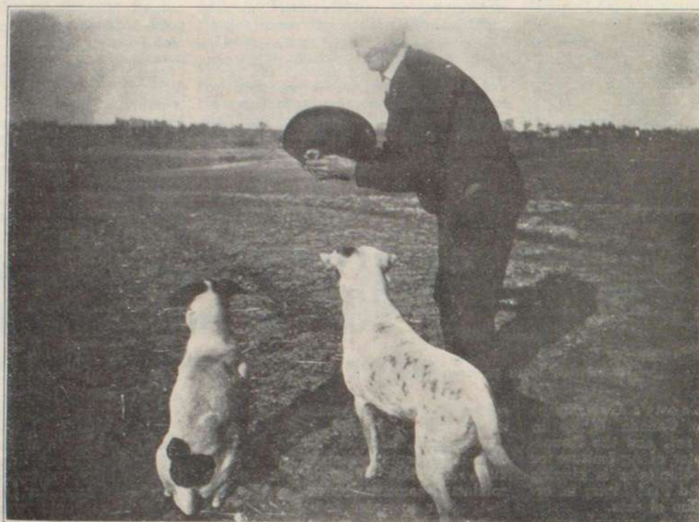
The hunters laid regular siege to places where rats were known to be, some working inside and others waiting outside with the dogs, 526 rats being killed at one farm.