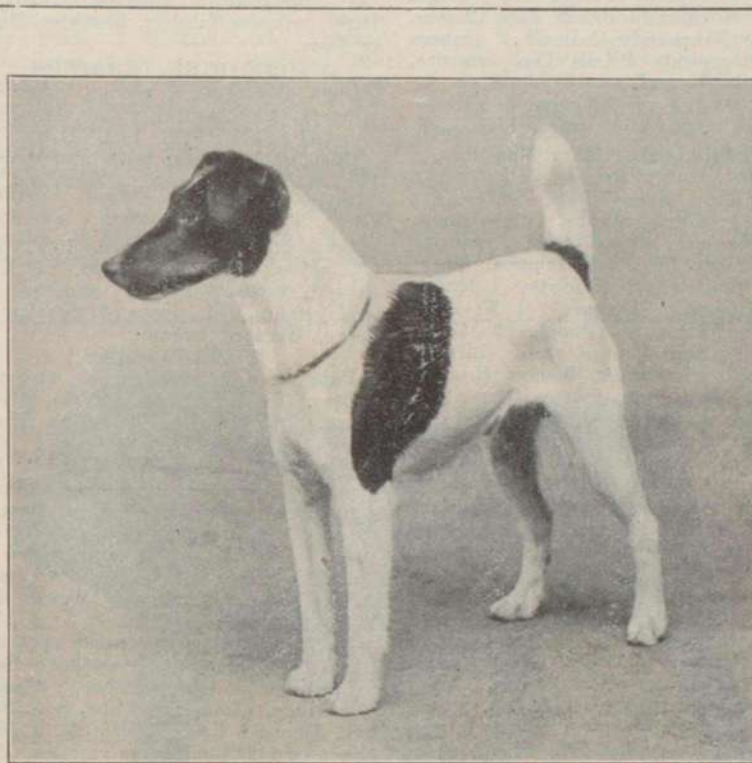
THE SMOOTH FOX TERRIER, MARCONIAN