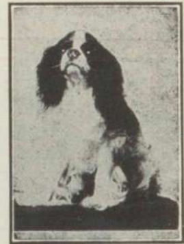
CELAMO BERTONE 9.13

Celamo Kennels 19 Sanford St., Rochester, N.Y.