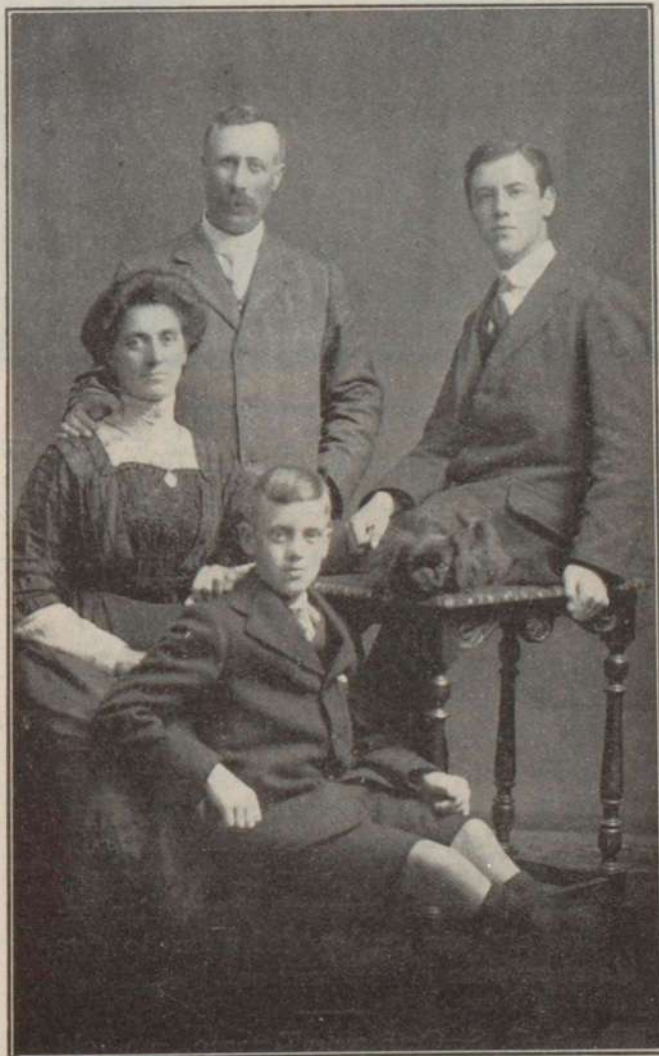
"THE BAILLIE AT HOME"