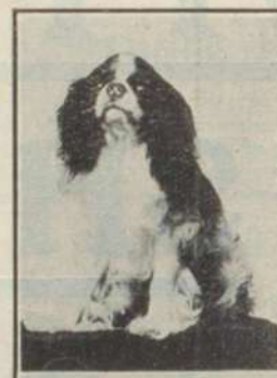
CELAMO BERTONE 9.13