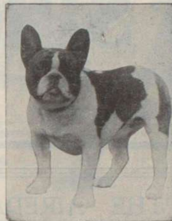
Ch. Charlemagne of Amersham