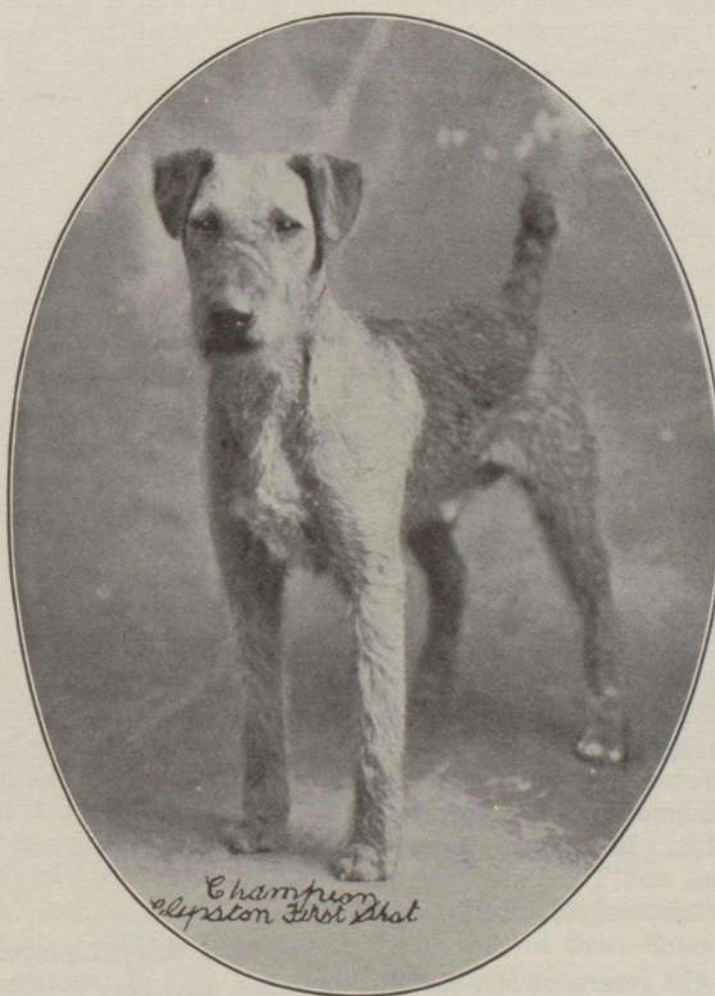
CHAMPION CLIPSTON FIRST SHOT. The Airedale That Came Back.