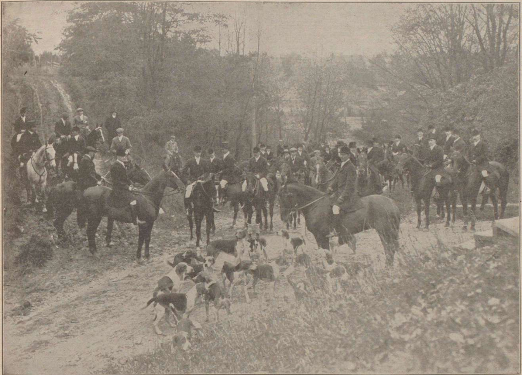
"A HUNTING WE WILL GO."

A Group of the Members of the Toronto Hunt Club Photographed at York Mills, Before Moving into Their New Club House at Steele's Corners.