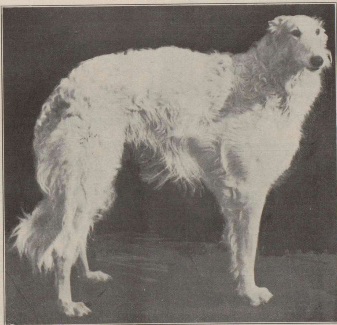
THE RUSSIAN WOLFHOUND, CH. YRNAK O' VALLEY FARM, 140916

Ch. Rasboi o'Valley Farm ex Safa o'Valley Farm. He holds an unbeaten record and is one of the best. Owned by the S. V. Kennels, Williams, California, U.S.A.