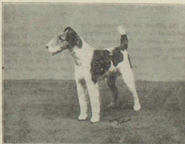
CH. HAWES BROOM