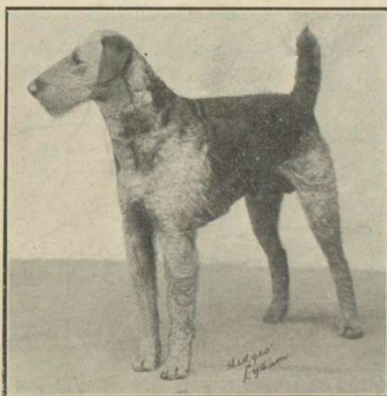
THE WINNING AIREDALE TERRIER