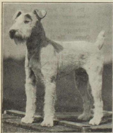
LEEDS WALTZ DREAM