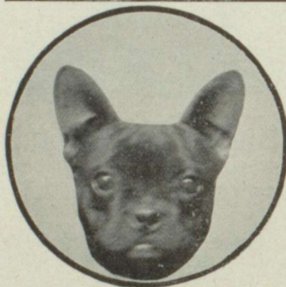
PRINCE DE CELLEMARE (C. K. C. 14867)