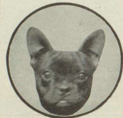
PRINCE DE CELLEMARE (C. K. C. 14867)

F. C. HUNT - 357 College Street, TORONTO