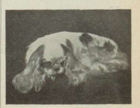
ENGLISH TOY SPANIELS In the Four Varieties FOR SALE AND AT STUD Write For Circulars.