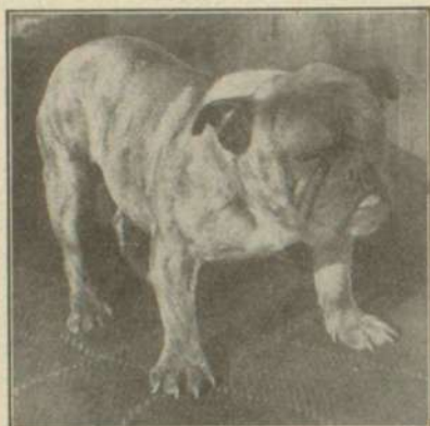
CH. COSTER'S DIAMOND Color Light Brindle. Weight 44 lbs. FEE $15.00 prepaid.