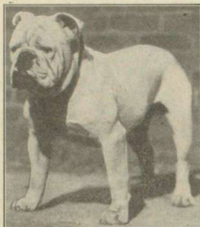
The Imported Heavyweight. Weight 62 lbs. "TRY AGAIN WILLIAM" FEE $15.00 prepaid