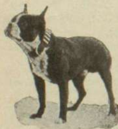
Ch. Onadaga's Buster (C.K.C. 15191)