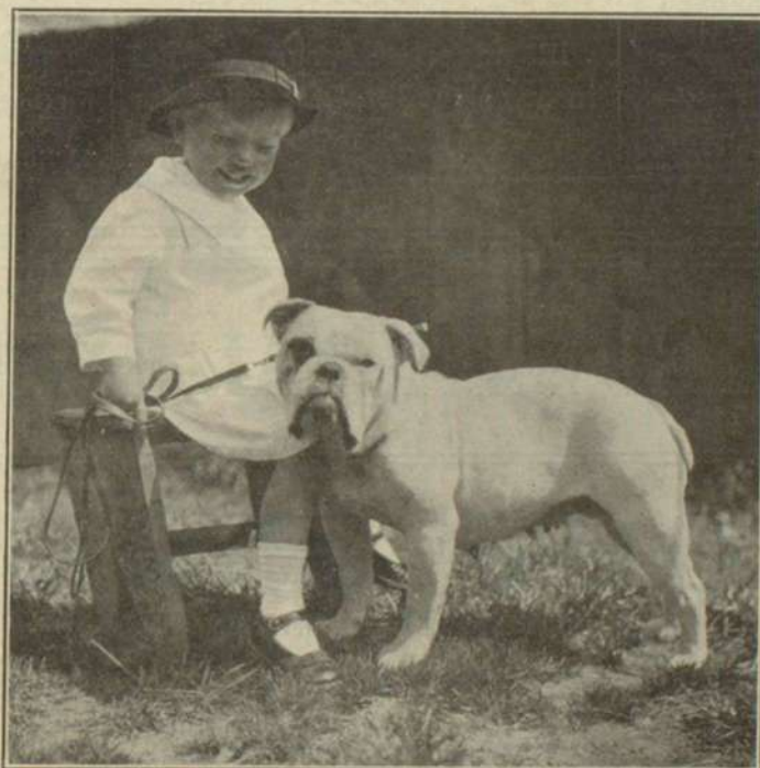
A Brace of "Champions."