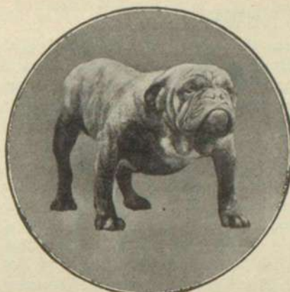
MASTER PENFOLD Brindle