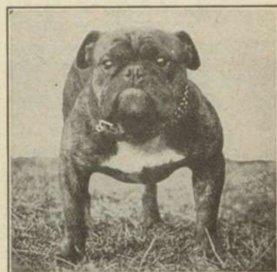
WALNUT CRIB Color Dark Brindle. Weight 44 lbs. FEE $15.00 prepaid.

Out of town clients ship all bitches to 206 Queen St. East, Toronto. For stud cards apply owner.