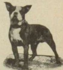
Bonnington Sporty (C.K.C. 19440)