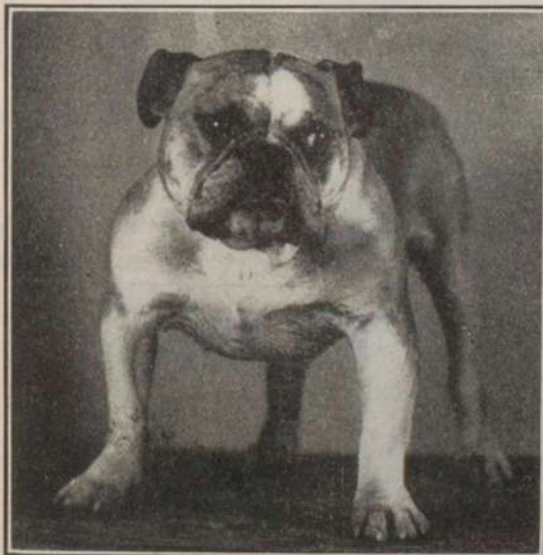
CLEVELOCK UNITY (C.K.C. 22873)

The well known, imported English Winning Bulldog