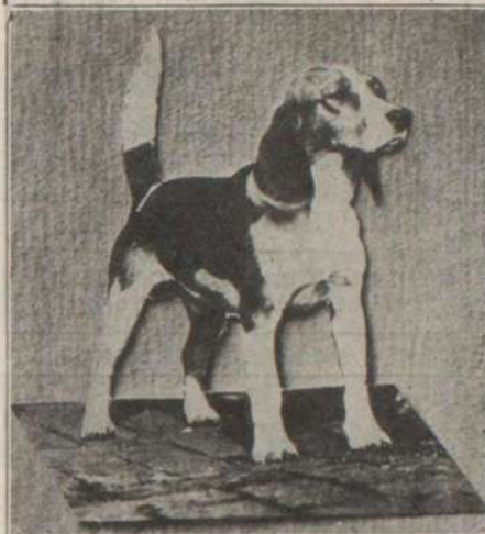
Ch. Shannons Bandit (four cham- pionships), a grand hunter. Fee $10.

Afton Sportsman—The sensation- al 1919 winner of the Western Fu- turity Field Stake, and winner of First Open, and Winners Dog at the Western Field Point Dog Show.