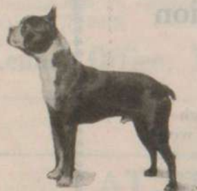
Ch. Yankee Speed King C.K.C. 23479

CH. YANKEE SPEED KING (C.K.C. 23479, A.K.C. 269807)