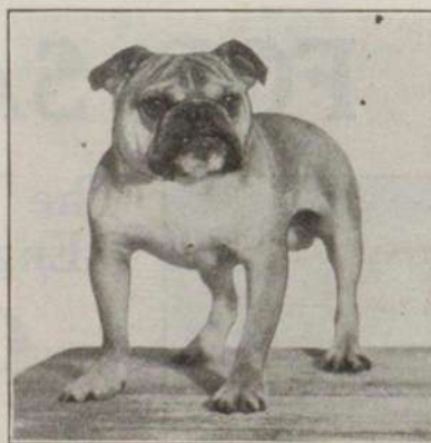
DIAMOND RED DEMON.

His stud fee from now on will be $20.00 Prepaid.