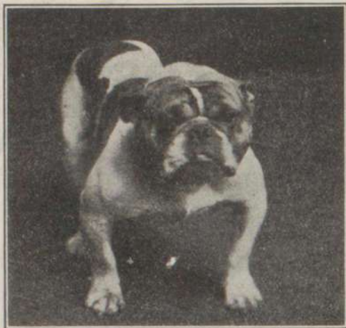
DIAMOND THORNFIELD PRIDE, Imp.