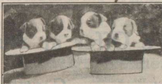
Sample Litter by Ch. Count. Dee Cee.

Females visiting my kennels receive the best attention.