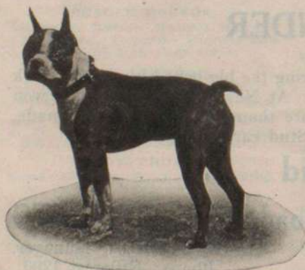
LITTLE MICKEY RINGMASTER