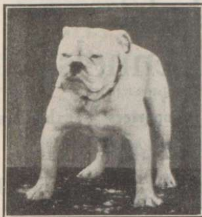
ADVANCE GUARD C.K.C. 22110