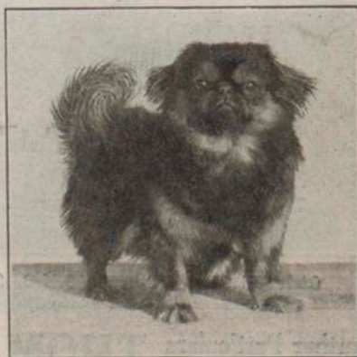
DIAMOND RIGHT KIND.

At present his stud fee will be $20.00, prepaid.