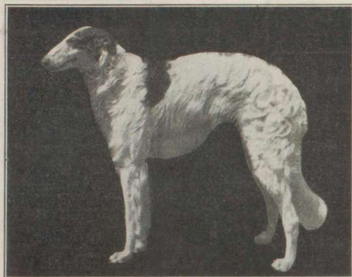
Champion "Krilenko" (C.K.C. 23646).