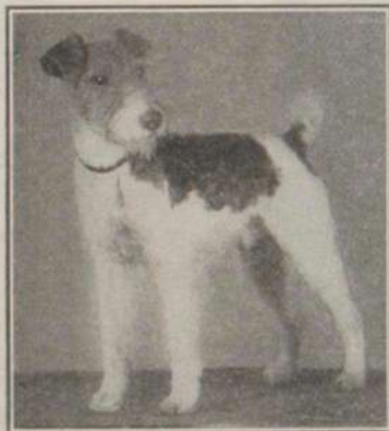
PARKTON COLLARBONE (C.K.C. 22198)