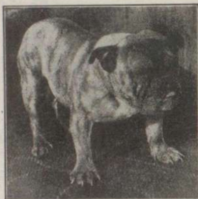
CHAMPION COSTER'S DIAMOND.