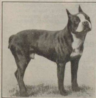
PRINCE OXONIAN. (C.K.C. 22963) (A.K.C. 230959)