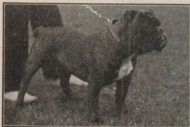
BANKERS CONQUEROR (C.K.C. 23225)

Stud Fee $20.00 to approved local matrons $25.00 to approved out-of-town matrons