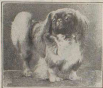
WALNUT MANNIKIN (C.K.C. (22556))