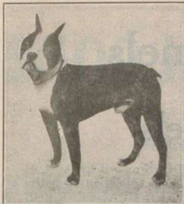
CH. COUNT DEE CEE C.K.C. 20747 Weight 17½ lbs.