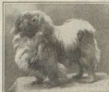
SUNNI OF SOMME (C.K.C. 23120)

Another "Real Peke," color, red brindle. A big winner in fast company at the English Shows.