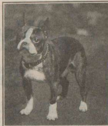
REX RAFFLES FASCINATOR C.K.C. 22995 Weight 12½ lbs.

THE HOME OF CANADA'S BEST BOSTON TERRIERS