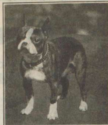
REX RAFFLES FASCINATOR C.K.C. 22995 Weight 12½ lbs.

THE HOME OF CANADA'S BEST BOSTON TERRIERS