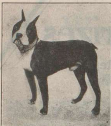
CH. COUNT DEE CEE C.K.C. 20747 Weight 17½ lbs.