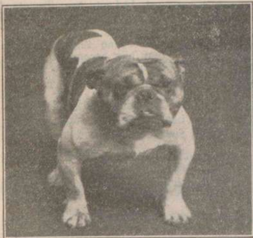
DIAMOND THORNFIELD PRIDE, Imp. (C.K.C. 22778) (A.K.C. 285639)