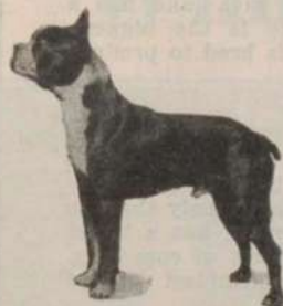
Ch. Yankee Speed King C.K.C. 23479

CH. YANKEE SPEED KING (C.K.C. 23479, A.K.C. 269807)