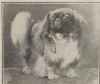
Champion WALNUT MANNIKIN C. K. C. (22556)