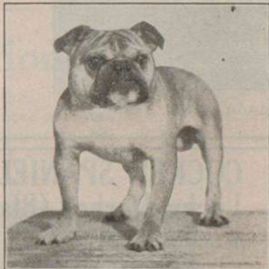
DIAMOND RED DEMON. (C.K.C. 22779) (A.K.C. 285638)

to ground, and short-bodied. Just been once shown and won the cup for best in show. At time of writing this dog has been kept busy at stud, bitches coming from all over Canada.