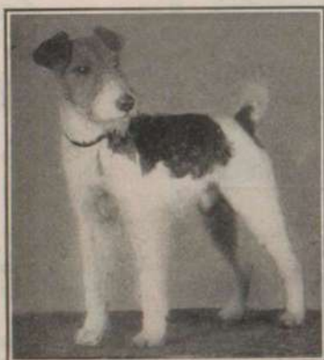
PARKTON COLLARBONE (C.K.C. 22198)