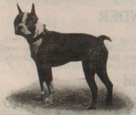
LITTLE MICKEY RINGMASTER

1st Puppy , 1st Novice, 1st Canadian-bred, 1st Limit, and Reserve Winners to Ch. Paramount Star, London, May 11-12, 1920.