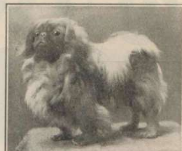
SUNNI OF SOMME (C. K. C. 23120)

Another "Real Peke," color, red brindle. A big winner in fast company at the English Shows.