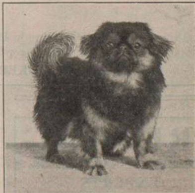
DIAMOND RIGHT KIND. (C.K.C. 22776) (A.K.C. 285640)

At present his stud fee will be $20.00, prepaid.