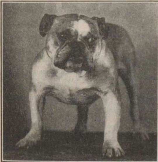
CLEVELOCK UNITY (C.K.C. 22873)

The well known, imported English Winning Bulldog