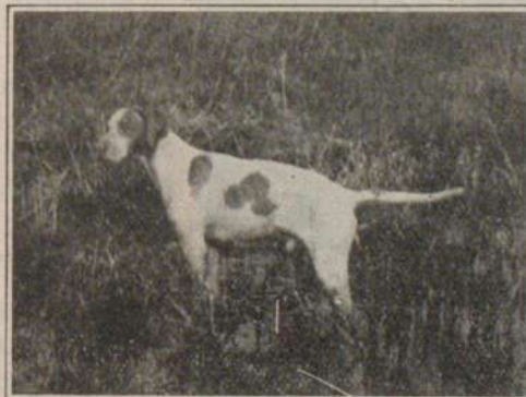
TOBY KENT—Field Trial & Bench Winner.

15-in. All-Age—$1 to enter, $1 to start. Purses divided 50%, 30% and 20%.