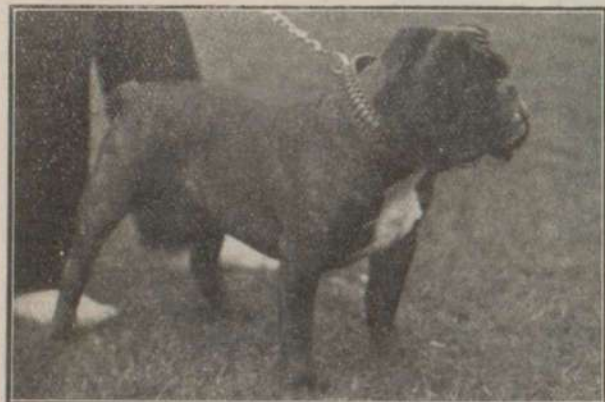
BANKERS CONQUEROR (C.K.C. 23225)

Stud Fee $20.00 to approved local matrons $25.00 to approved out-of-town matrons