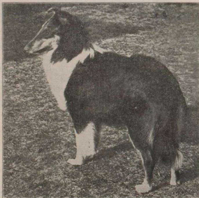
INTERNATIONAL CHAMPION ALSTEAD AEROPLANE. (C.K.C. 23954), (A.K.C. 217677).

BEST OF CARE TAKEN OF VISITING MATRONS, BUT ARE RECEIVED ENTIRELY AT OWNER'S RISK.