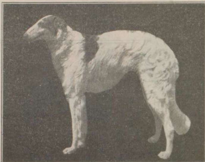
Champion "Krilenko" (C.K.C. 23646).