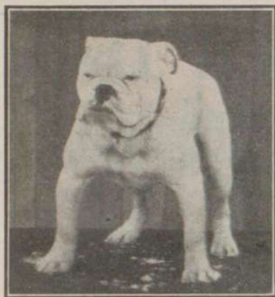
ADVANCE GUARD C.K.C. 22110