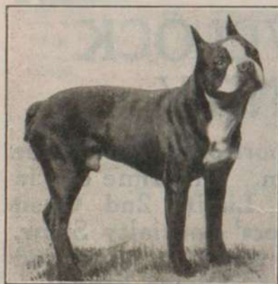
PRINCE OXONIAN. (C.K.C. 22963) (A.K.C. 230959)