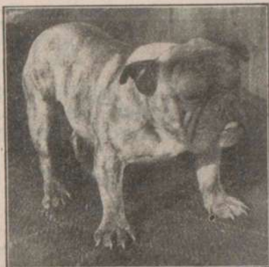
CHAMPION COSTER'S DIAMOND. (C.K.C. 15614) (A.K.C. 237889)