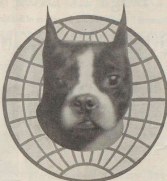
"GLOBE SWEET WILLIAM" (C.K.C. 22089) FEE—To out-of-town females, $15.00; to London-owned females, $20.00.