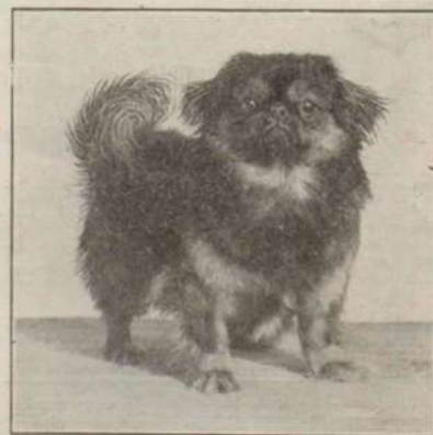
DIAMOND RIGHT KIND. (C.K.C. 22776) (A.K.C. 285640)

The well-known show Bull Bitch, "Fascinating Kate," sire, Kilburn Fascinator," ex "Katerina." Born May 1st, 1919. Also "Rich Gift," the imported show Bull Bitch, sire, "Thornwood King Arthur," ex "Clarksfield Baroness." Born July 22nd, 1918. Unless you want good bitches, don't write about these two.