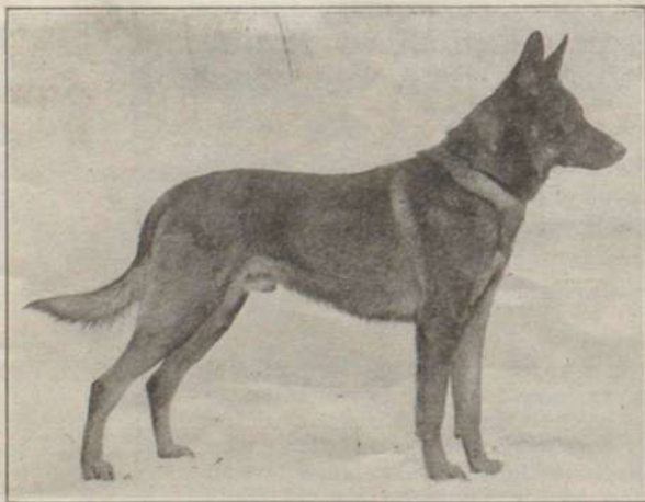
CHAMPION STAR MASTER.

CHAMPION STAR MASTER (A.K.C. 254232) —Whelped June 10th, 1918. Color, Dark Wolf Grey; a great show dog and a producer of high-class stock. FEE, $50.00.