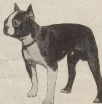
The Little Welshman.