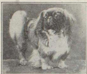
CH. WALNUT MANNIKIN (C.K.C. 22556)