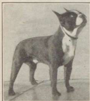
Globe Tiny Tim (C.K.C. 26227) FEE $15.00

Globe Tiny Tim (weight 12 lbs.) a little brother to Ch. League o' Nations ; Reserve Winners to the League at the last Toronto show; Reserve Winners to Ch. Sweet William at Guelph. This grand-headed little fellow, in type and general characteristics, has been likened to the famous sire, Intruder . He gives every promise of being a wonderful stud dog.