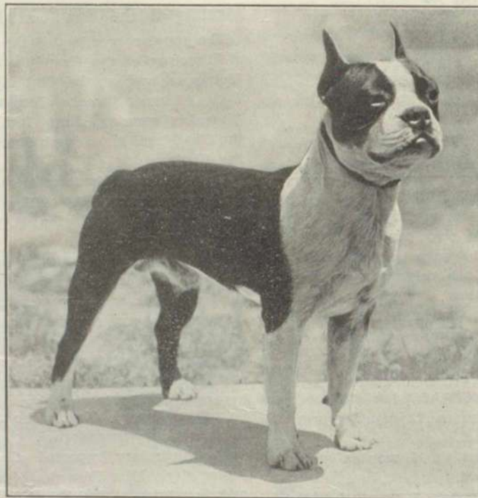
CH. GLOBE LEAGUE O' NATIONS.

A new record for Boston terriers was established at the Montreal Kennel Club show when "Globe League O'Nations," the fourteen months old youngster was returned best Boston and incidentally completed his own championship—making the coveted title in nine weeks without a defeat. The former record was held by the dog's grandsire "Ch. Ingrams's Little Man" who made the title in fifteen weeks without a defeat. It is a fitting tribute to the former holder of the record that the honor of establishing a new record reverts to one of his own descendants.