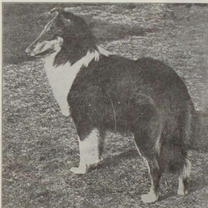
INTERNATIONAL CHAMPION ALSTEAD AEROPLANE. (C.K.C. 23954), (A.K.C. 217677).

Give us at least seven days' notice of your inten- tions of shipping. It will pay you to do so.