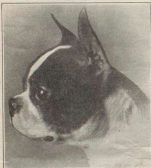
LITTLE MICKEY RINGMASTER" (C.K.C.S.B. 22114) Weight, 13 1/4 lbs.