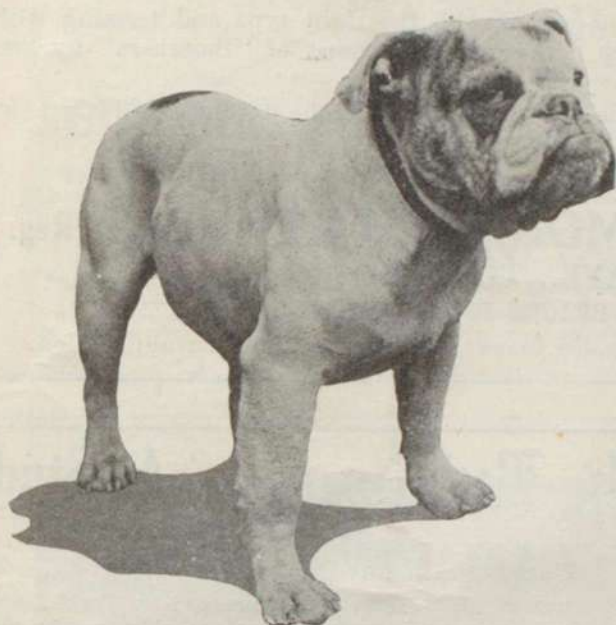
ST. BLAISE (C.K.C. 25052)