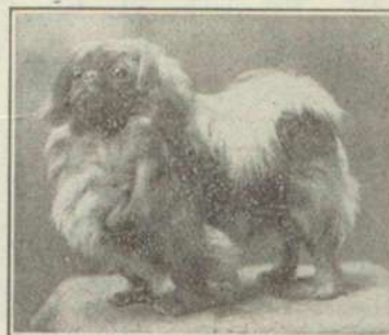
CH. SUNNI OF SOMME (C.K.C. 23120)

These two dogs have very broad, square, black muzzles, absolutely smashed up faces, flat skulls, and wonderful bone, beautiful coats and grand feathering. They are the most cobby and lowest to ground Pekes before the fancy to-day. Siring large, healthy litters. If you want winners, breed to winners.