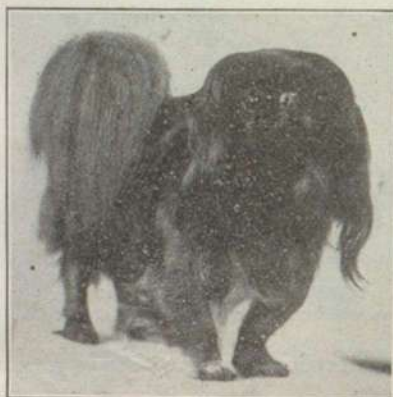
Ch. "Prince Cha of Alderbourn" (C.K.C.S.B. 25382) The Undefeated Canadian Champion.

By placing Champion "Prince Cha" at Stud at this low figure, I have placed New York at your door, and have reduced his fee from $50, and no exchange at 12 per cent., or express charges and U.S. duty.