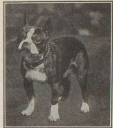
REX RAFFLES FASCINATOR C.K.C. 22995 Weight 12½ lbs.

THE HOME OF CANADA'S BEST BOSTON TERRIERS