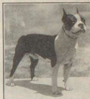
Ch. Globe League o' Nations , (C.K.C. 26226)

FEE to out-of-town females, $20.00; to London-owned females, $25.00.