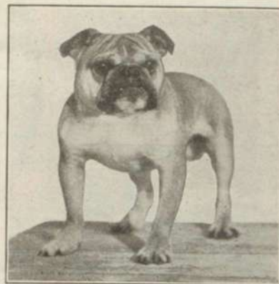
DIAMOND RED DEMON. (C.K.C. 22779) (A.K.C. 285638)

AT PRESENT HIS STUD FEE WILL BE $20.00 PREPAID