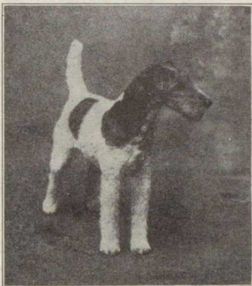
CHAMPION "DUSKY BOUNCE"