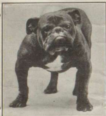
DUNDEE KNIGHT, Imp. (C.K.C. 24107) (A.K.C. 285637)