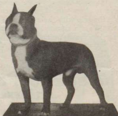
THE "LITTLE COUNT"