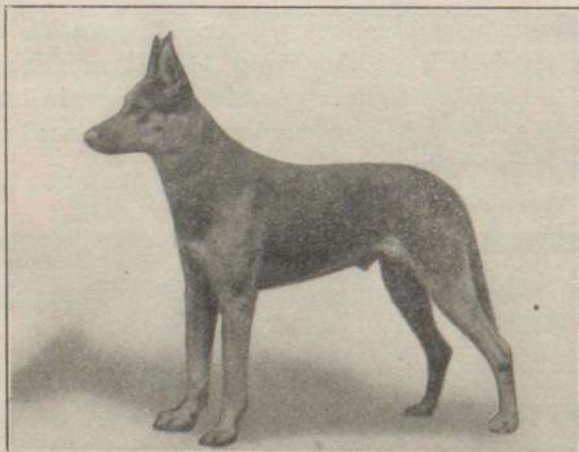
STAR DOLF V. MICHELSBERG

Winners Dogs at Montreal, May and June, 1921.