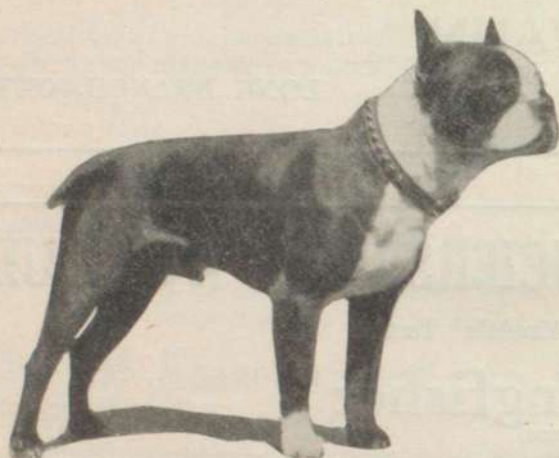
Ch. Jackson's Paddy Dee.

The Famous Winning Siring Boston Terrier