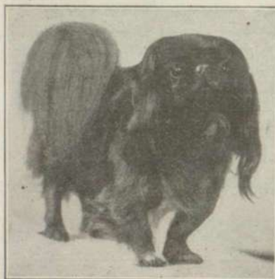
Ch. "Prince Cha of Alderboune" (C.K.C.S.B. 25382) The Undefeated Canadian Champion.

Toronto Kennel Club (Fall) Show, 1920, 1st Open and Winners, Special Best Peke; Toronto Kennel Club (Spring) Show, 1921, 1st Open, Winners; Detroit Kennel Club, 1921, Best Peke; London Canine Association (Spring) 1921, Best Peke in Show; Winnipeg, 1921, Best Peke in Show.