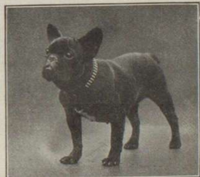
CH. LA REINE D'ANJOU

Best of the Breed in Show Best of Opposite Sex Best Brace Best Team Best Stud with 2 of his Produce Best Bitch of All Breeds Best Non-Sporting Dog in Show