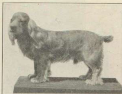
LIBERATOR, C.K.C.S.B. 21794