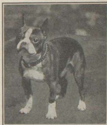
REX RAFFLES FASCINATOR C.K.C. 22995 Weight 12½ lbs.

THE HOME OF CANADA'S BEST BOSTON TERRIERS