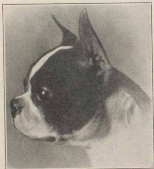
LITTLE MICKEY RINGMASTER" (C.K.C.S.B. 22114) Weight, 13¼ lbs.