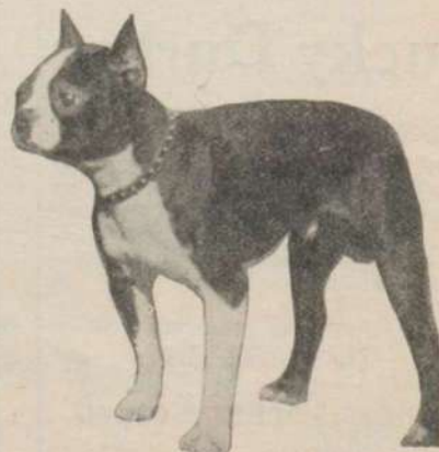
The Little Welshman.