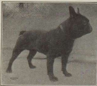
CH. GAMIN'S RIVAL, Jr.

CH. GAMIN'S RIVAL, Jr. (6 yrs.)—$200. (Ch. Gamin's Rival ex Princess Menelik) STUD FEES, $25.00