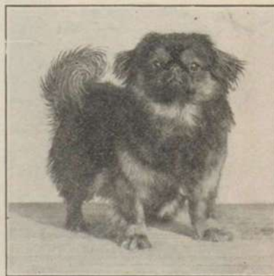
DIAMOND RIGHT KIND. (C.K.C. 22776) (A.K.C. 285640)

The well-known show Bull Bitch, "Fascinating Kate," sire, Kilburn Fascinator," ex "Katerina." Born May 1st, 1919. Also "Rich Gift," the imported show Bull Bitch, sire, "Thornwood King Arthur." ex "Clarksfield Baroness." Born July 22nd, 1918. Unless you want good bitches, don't write about these two.