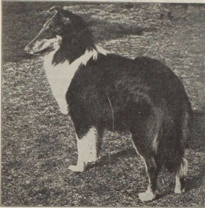
INTERNATIONAL CHAMPION ALSTEAD AEROPLANE. (C.K.C. 23954), (A.K.C. 217677).