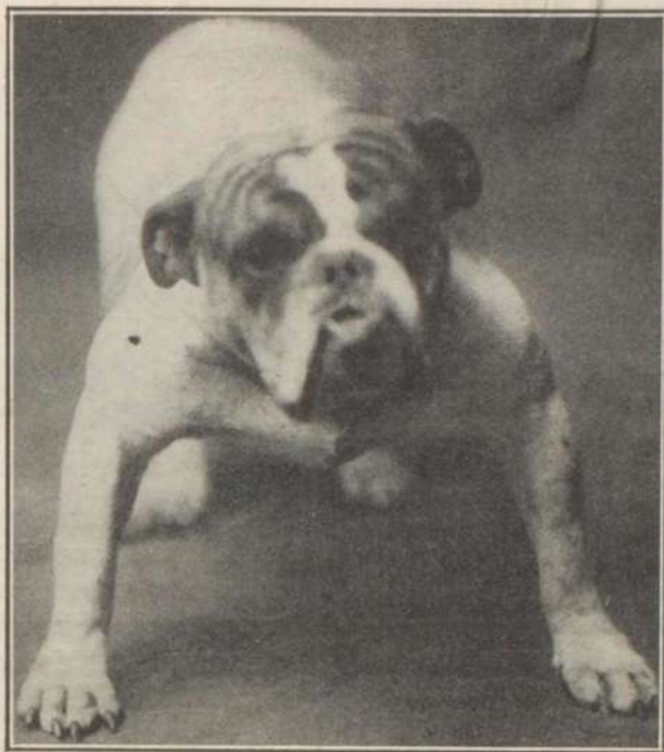
ROCKLEY SILENT WITNESS.