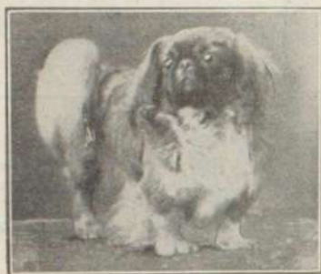
CH. WALNUT MANNIKIN (C.K.C. 22556)