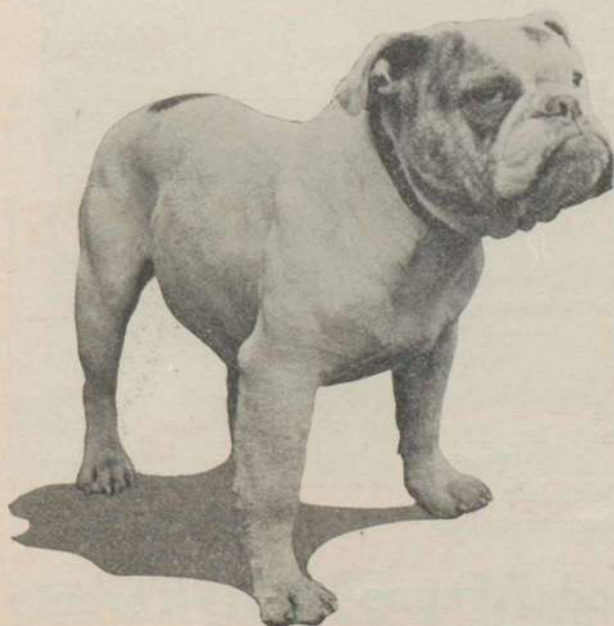
ST. BLAISE (C.K.C. 25052)