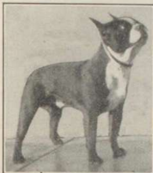
Globe Tiny Tim (C.K.C. 26227) To Out-of-Town Females $10. London-owned Females $15.

Globe Tiny Tim (weight 12 lbs.) a litter brother to Ch. League o' Nations; Reserve Winners to the League at the last Toronto show; Reserve Winners to Ch. Sweet William at Guelph. This grand-headed little fellow, in type and general characteristics, has been likened to the famous sire, intruder. He gives every promise of being a wonderful stud dog.