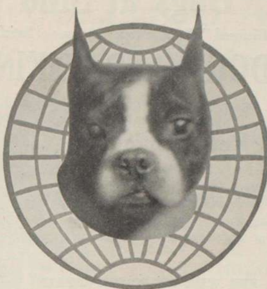
Ch. "GLOBE SWEET WILLIAM" (C.K.C. 22089) FEE—To out-of-town females, $15.00; to London-owned females, $20.00.