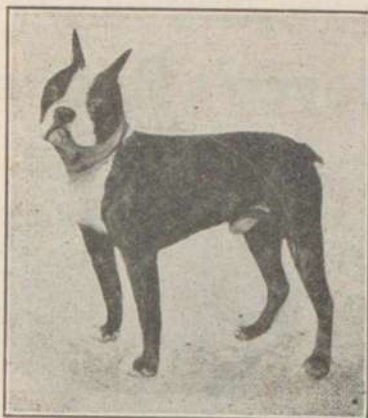
CH. COUNT DEE CEE C.K.C. 20747 Weight 17½ lbs.