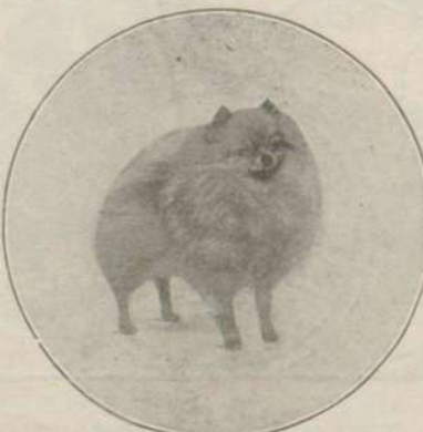
The Typical Pomeranian