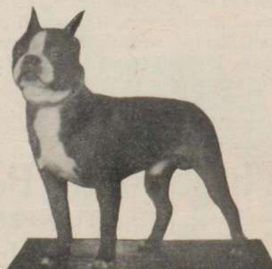
THE "LITTLE COUNT"