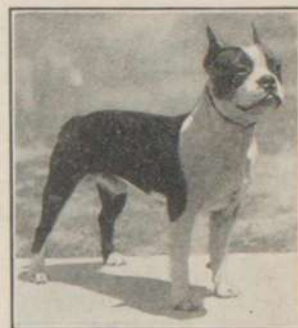
Ch. Globe League O' Nations , (C.K.C. 26226)

FEE to out-of-town females, $20.00; to London-owned females, $25.00.