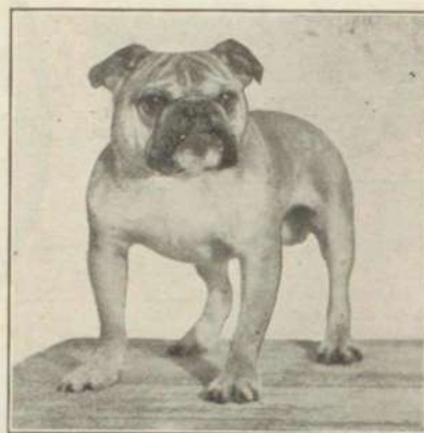
DIAMOND RED DEMON. (C.K.C. 22779) (A.K.C. 285638)

AT PRESENT HIS STUD FEE WILL BE $20.00 PREPAID