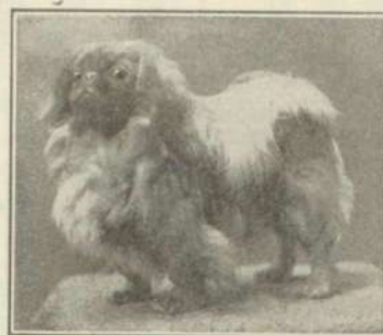
CH. SUNNI OF SOMME (C.K.C. 23120)

STUD FEE (for the present) $35.00 Ch. Sunni of Somme, Imp. Fee $30. Another "Real Peke," color, red brindle. A big winner in fast company at the English Shows. Best Pekingese dog at the Canadian National Exhibition, 1920.