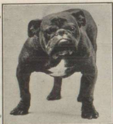
DUNDEE KNIGHT, Imp. (C.K.C. 24107) (A.K.C. 285637)