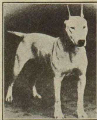
THE GREAT INFERNO,