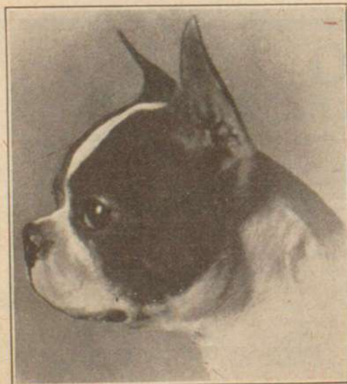
LITTLE MICKEY RINGMASTER" (C.K.C.S.B. 22114) Weight, 13¼ lbs.

Notices of Matings, also Births of Litters. At the prepaid rate of 3 cents per word or figure.