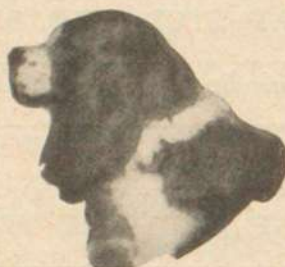
MAN O' WAR