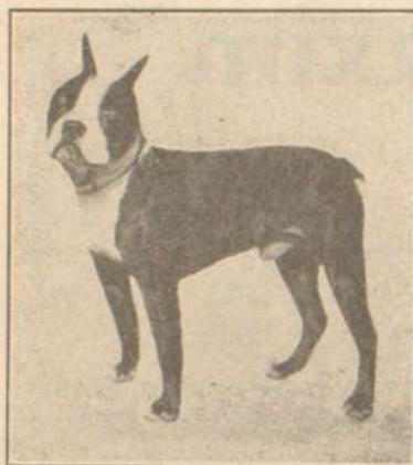
CH. COUNT DEE CEE C.K.C. 20747 Weight 17½ lbs.

In breeding to any of these dogs, you are using the best stud and show specimens.