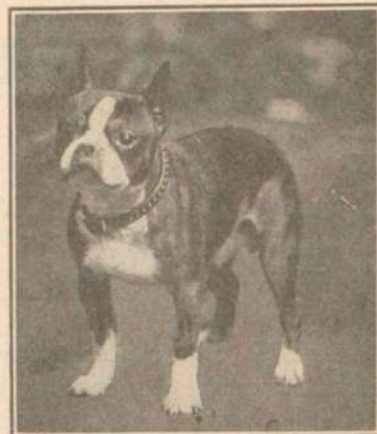
REX RAFFLES FASCINATOR C.K.C. 22995 Weight 12½ lbs.

THE HOME OF CANADA'S BEST BOSTON TERRIERS