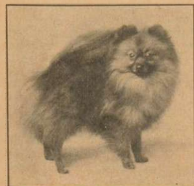
Tweedledum of Vertikop