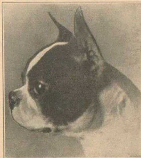
LITTLE MICKEY RINGMASTER" (C.K.C.S.B. 22114) Weight 11 1/2 lbs.