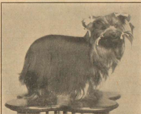
The Yorkshire Terrier BLUE COUNTESS (Imp.) (C.K.C.S.B. 33647) Property of JOS. EDGAR, TORONTO