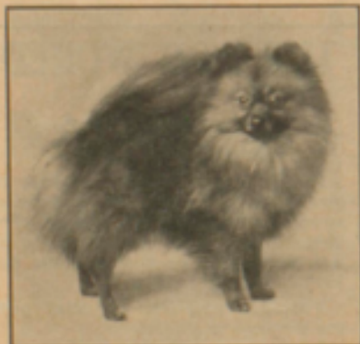
Tweedledum of Vertikop

FEES (strictly to approved matrons only) $20.00.