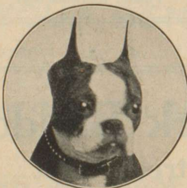
OUR KING PIN (Imp.)

Rich Sea Brindle Ideal Face Markings Expressive Eyes Perfect Head