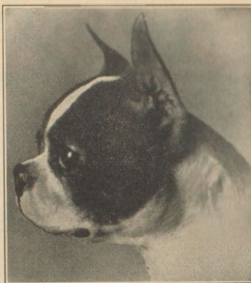
"LITTLE MICKEY RINGMASTER" (C.K.C.S.B. #22114) Weight 13 1/2 lbs.