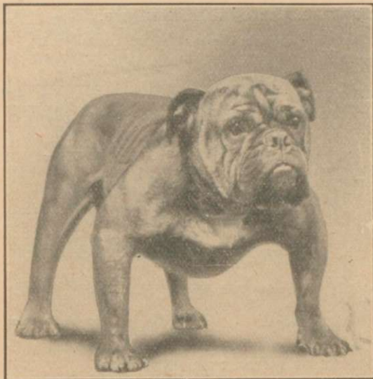
HEFTY MONARCH (Imported) (C.K.C.S.B. 27248) (A.K.C.S.B. 317461)

Following the last C.N.E. Dog Show, it was a wonderful entry. Hefty Monarch has proven his claim to be the most consistent sire of high-class stock in Canada and the United States.