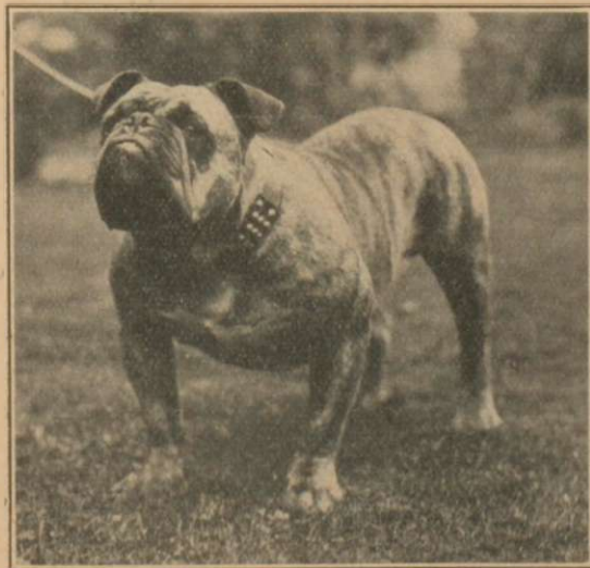
BURNABY'S ANKER (Imp.) (No. 10, 11, 12, 13, 14, 15, 16, 17, 18, 19, 20, 21, 22, 23, 24, 25, 26, 27, 28, 29, 30, 31, 32, 33, 34, 35, 36, 37, 38, 39, 40, 41, 42, 43, 44, 45, 46, 47, 48, 49, 50, 51, 52, 53, 54, 55, 56, 57, 58, 59, 60, 61, 62, 63, 64, 65, 66, 67, 68, 69, 70, 71, 72, 73, 74, 75, 76, 77, 78, 79, 80, 81, 82, 83, 84, 85, 86, 87, 88, 89, 90, 91, 92, 93, 94, 95, 96, 97, 98, 99, 100)

His collection was one of the best in the world, and his dogs were highly prized by all who knew them. His collection was one of the best in the world, and his dogs were highly prized by all who knew them.