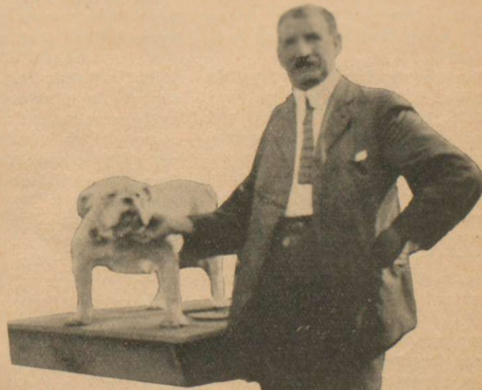
BURNABY'S ANKER (Imp.)

His collection was one of the best in the world, and his dogs were highly prized by all who knew them. His collection was one of the best in the world, and his dogs were highly prized by all who knew them.