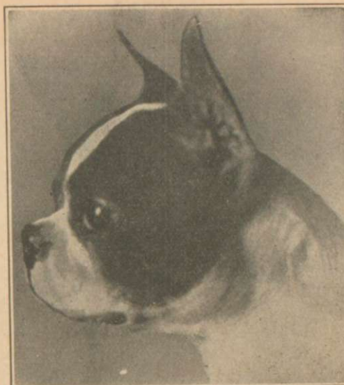
LITTLE MICKEY RINGMASTER (C.K.C.S.B. 22114) Weight 12 lbs.