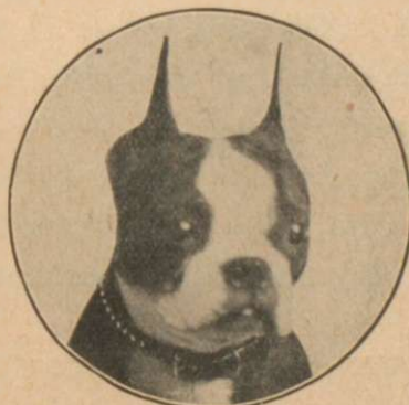
OUR KING PIN (Imp.)

"Our King Pin" is bred to be a producer of high quality stock. He is a son of "Snappy King," who was by "Bantam King," who was by "Ch. Peters King," and is a double cross to the famous Champion "Peters King," making "Our King Pin" one of the best bred Boston Terriers now before the fancy. His picture shows his remarkable head properties.