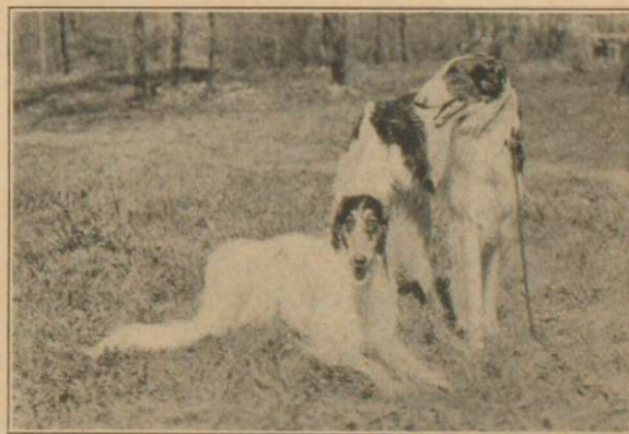
Nova and Boris were great pals.