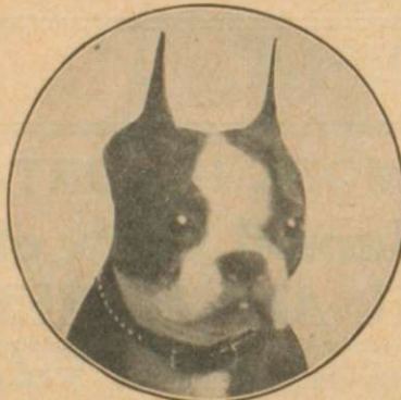
OUR KING PIN, Imp.

"Our King Pin" is bred to be a producer of high quality stock. He is a son of "Snappy King," who was by "Bantam King," who was by "Ch. Peter King," and is a double cross of the famous Champion "Peter King," making "Our King Pin" one of the best bred Boston Terriers now before the fancy. His picture shows his remarkable head properties.