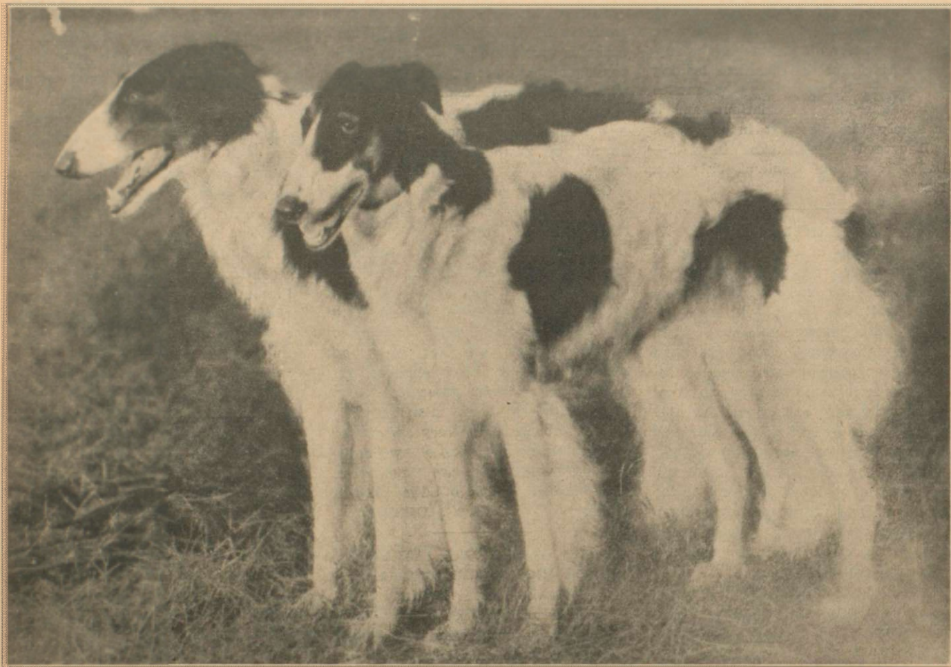
CHAMPION DUKE BORIS AND INTERNATIONAL CHAMPION NEVA ROMANOFF

Boris won the 1922 Challenge Trophy offered by the Russian Wolfhound Club of America for the best Russian Wolfhound dog shown during the year. Neva won the 1922 Challenge Trophy offered by the Russian Wolfhound Club of America for the best Russian Wolfhound bitch shown during the year.