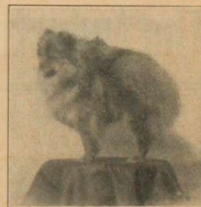
Cairndhu Gold Shade