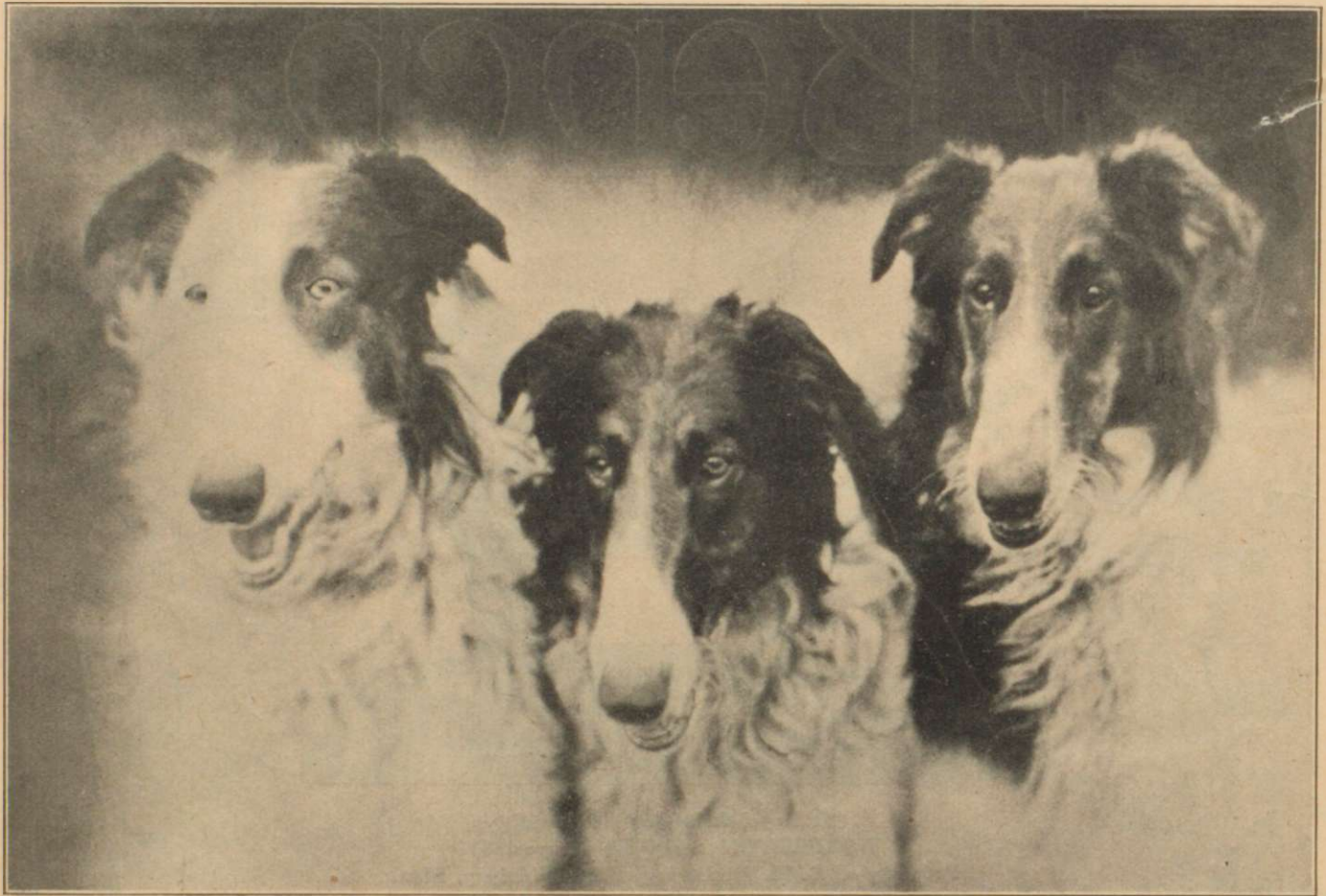
PETERHOF, KRONSTADT AND OLGA OF GLENWILD

B ORIS BEAT THE CHAMPION! The 1996 Wimbledon men's champion, Andre Agassi, was the only male player to win the title of the year's best player in the world. He was the only player to win the Wimbledon men's singles title in 1996. He was the only player to win the Wimbledon men's singles title in 1996. He was the only player to win the Wimbledon men's singles title in 1996.