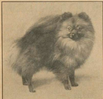
Tweedledum of Vertikop

The following array of imported Pomeranians: