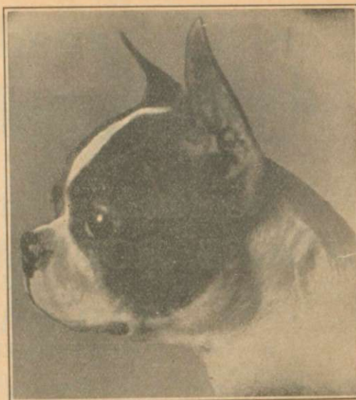
LITTLE MICKEY RINGMASTER C. K. C. S. B. 22114