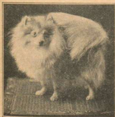
LILY HILL GOLD DUST, IMP. Mr. J. T. Waggitt, Toronto, Owner

One special word of caution may be useful in breeding blacks. I have found that the pure glossy black coat, absolutely free from any grey hairs, is not only of poor texture but breeds soft and floppy coats. A black must be sound in color according to the standard, but I consider harshness of equal, if not of more importance. To meet as far as possible both requirements in breeding blacks, I select parents who, to outward appearances, are sound blacks (not glossy), but whose coats will disclose a very few