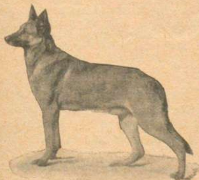
CITO VON ISCHELAND Sire—Arno v. d. Furstenburg Dam—Cleo v. Grafenwerth