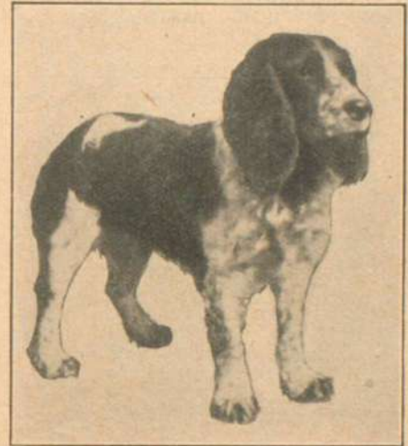
CORSLETTS SON OF A GUN