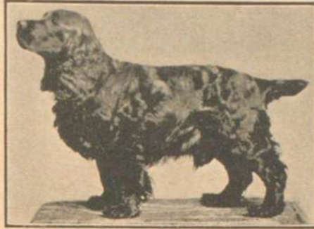
Fawcett's Man o'War, Son of Admiration