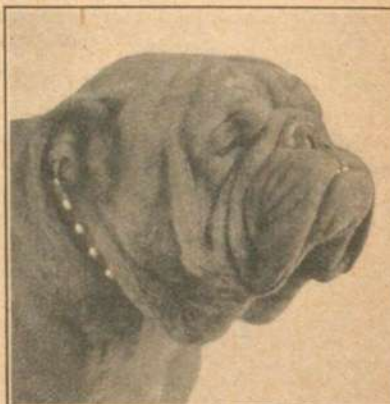
BANKERS BUDDY (C.K.C.S.B. 29909)

This grand young stud force by the noted Irish Challenger is getting magnificent stock, and his services are continually in demand.