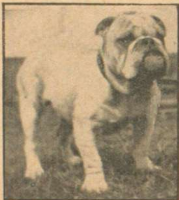
Unposed, untrimmed photo of PICCADILLY VICTORIOUS as he is to-day—twenty months old