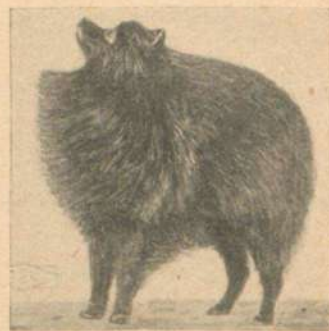
Ch. Chiswick Marquis

Grown Stock, Puppies and Bench Show Specimens generally for sale, and if the choosing is left to me, you will be satisfied.