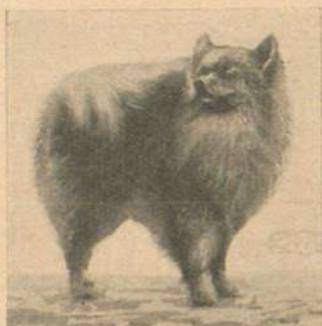
Tweedledum of Vertikop

FEE $20.00—To approved matrons—FEE $20.00