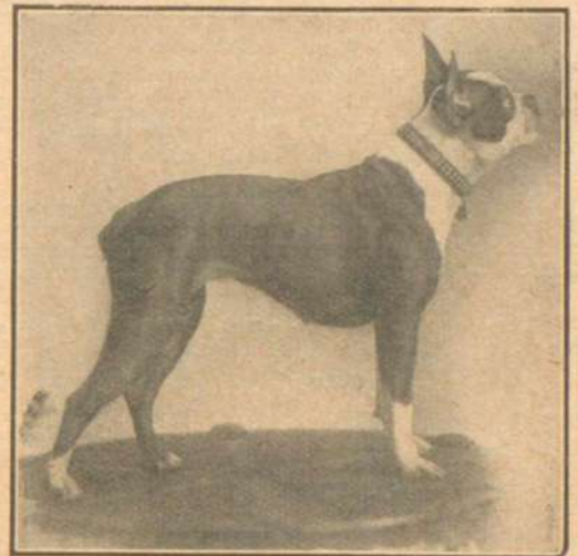
Lady Kingbencher (C.K.C. 32780)