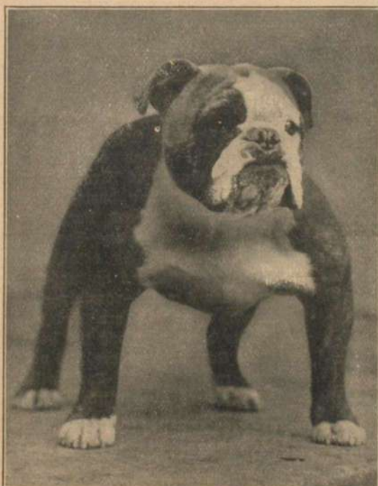
HEFTY ARGO Best Dog in Show, All Breeds.