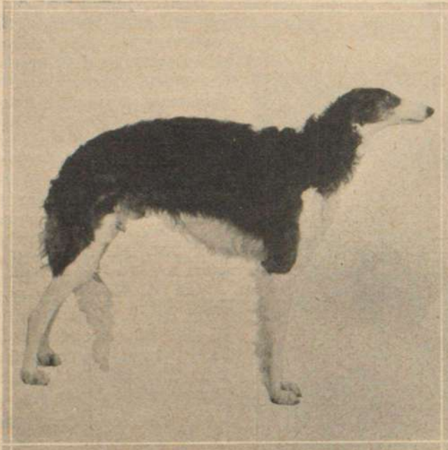
GALAROFF O' VALLEY FARM (C.K.C.S.B. 38426—A.K.C.S.B. 385760)