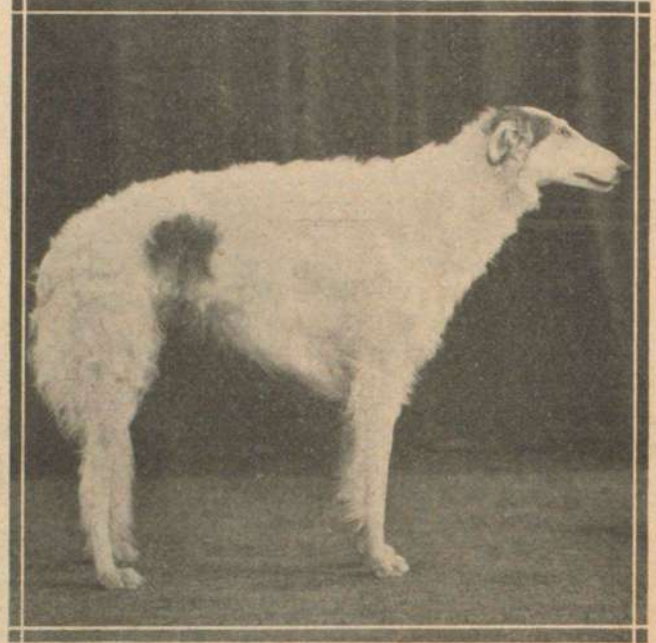
OSTRAND O' VALLEY FARM (C.K.C.S.B. 33801—A.K.C.S.B. 239743)