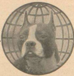
Head Study CH. GLOBE SWEET WILLIAM