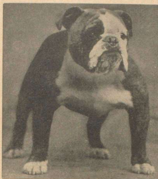
HEFTY ARGO Best Dog in Show, all Breeds—Toronto Kennel Club, April 10-11