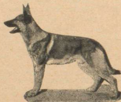
NOIR OF NORTH SHORE