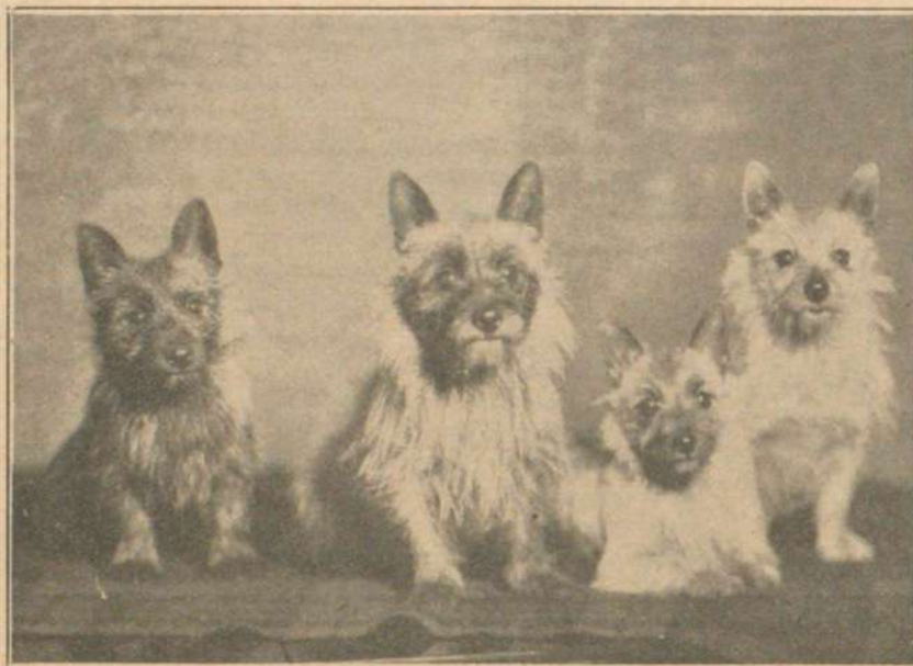
"SCOTLAND FOR EVER."