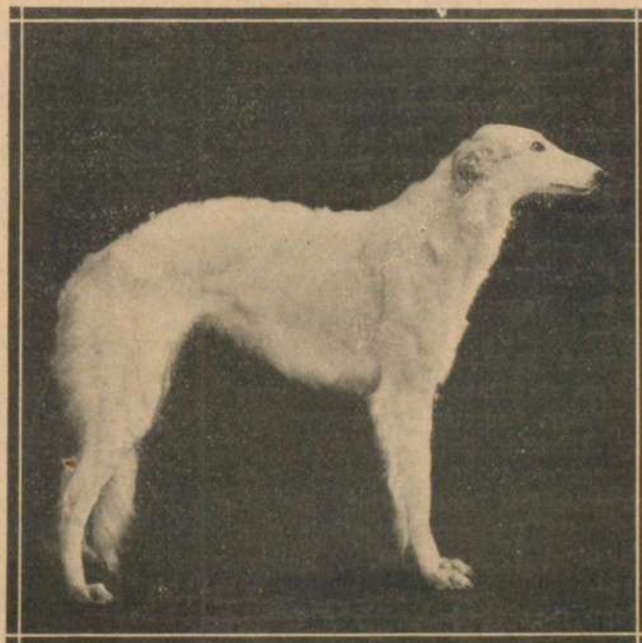
INT. CH. PRINCESS ORLOFF Reserve Best in Show, All Breeds.