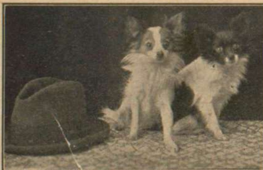
ACCOLODE FLANDRE FAIRY DE FLANDRE 2¼ lbs. Never been beaten. 2¼ lbs, and wideawake

Two Papillon Puppies Looking out on the Big Big World.