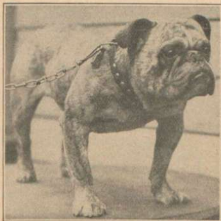
KING BILLY (From an untouched photograph)