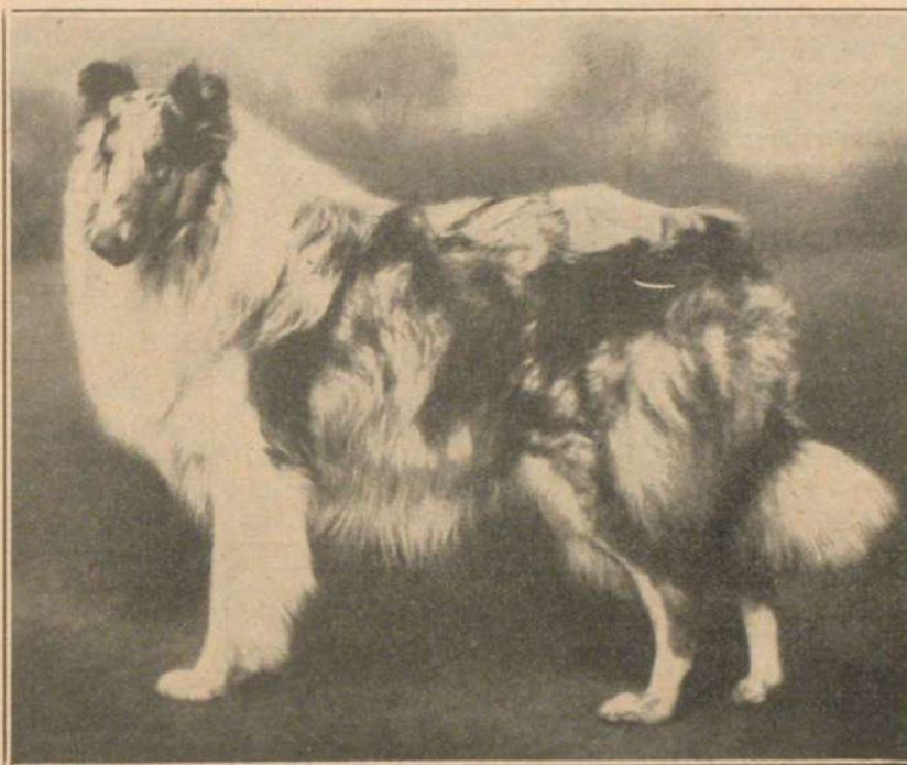
"A' 'OO AN' A YAIRD WIDE."