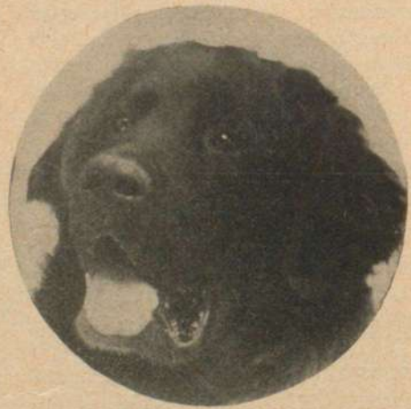
A MODERN NEWFOUNDLAND

This head study would do ideally if Newfoundland decided to again use a dog on its postage stamp.