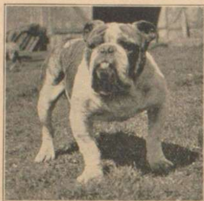
CH. MUIRAVONSIDE CHALLENGER