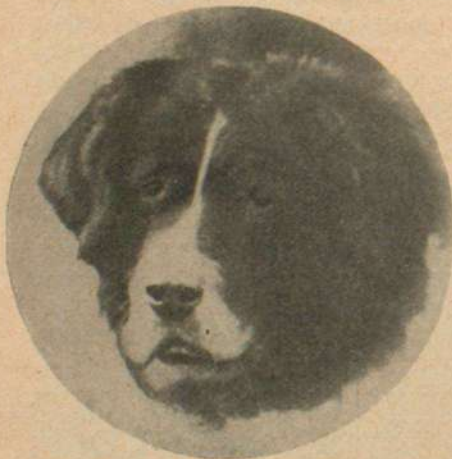
TYPICAL NEWFOUNDLAND HEAD.

Sir Edwin faithfully portrayed animal life in the early Victorian era, about 1837, and his brother made the engraving from which Sir Edwin's popularity came. To distinguish the black-and-white dogs from the blacks, which afterwards developed, the former were called Landseers. In case any doubt exists, and to refute the oft-repeated assertion that in order to produce Landseers a cross with the St. Bernards or dogs from the hospice at