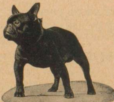
"CH. M. SANS PEUR"—16 Lbs.