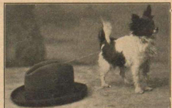
"JUST" PETERKINS Passing the Hat.

Two Papillon Puppies Looking out on the Big Big World.