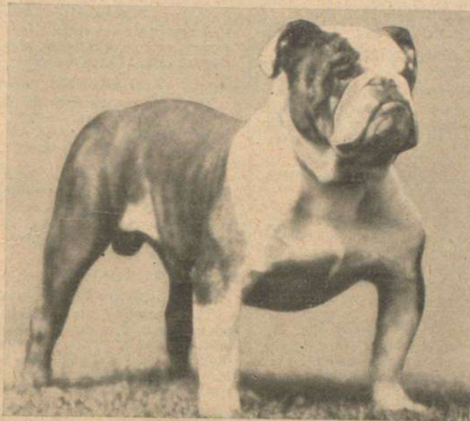
CHAMPION PRINCE OF WALES