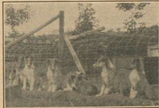
A LITTER Sired BY THE MOUNTAINEER