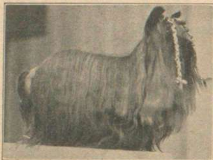
CH. LORD BYNG.