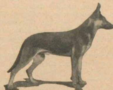
Ch. Alf Von Tollensetal.