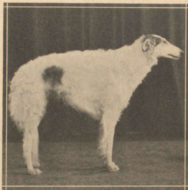
OSTRAND O' VALLEY FARM (C.K.C.S.B. 33801—A.K.C.S.B. 239743)