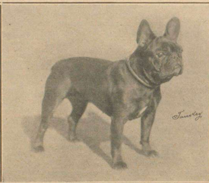
A CONSISTENT WINNER.

The Warily Kennels introduced a topping pair of home-bred puppies in Wire Fox Terriers that should make history when fully matured, especially the dog, Warily Gang Leader, one of the best youngsters seen for many a show, which went right through to Winners and made the famous Ch. Speedy Ball go some when it came to the specials. Warily Wire Girl of Wroseborough, looking very fit, was best in bitches, with same own-