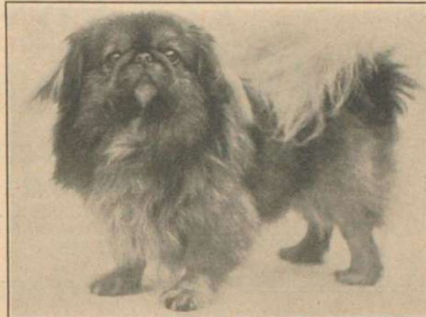
CH. T'SAN PAM OF BALCROFT