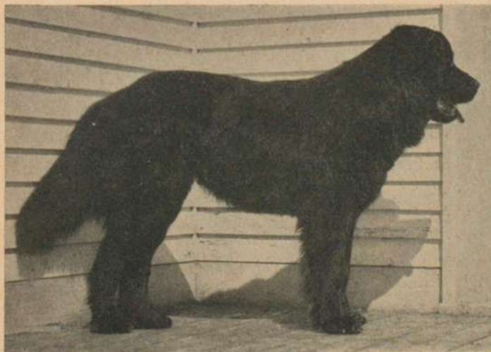
THE NEWFOUNDLAND OF TO-DAY.

Black is now the prevailing color of these dogs. They still have all the characteristics that formerly made them so popular