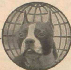
Head Study CH. GLOBE SWEET WILLIAM