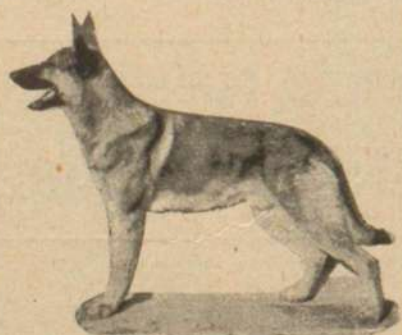
NOIR OF NORTH SHORE