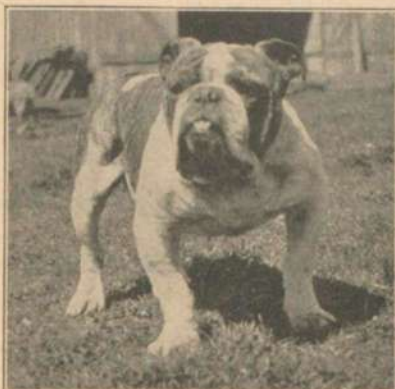
CH. MUIRAVONSIDE CHALLENGER