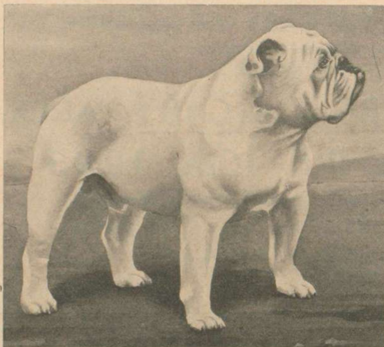
CH. KINGSWAY MAN-O'WAR (C.K.C.S.B. 25740)