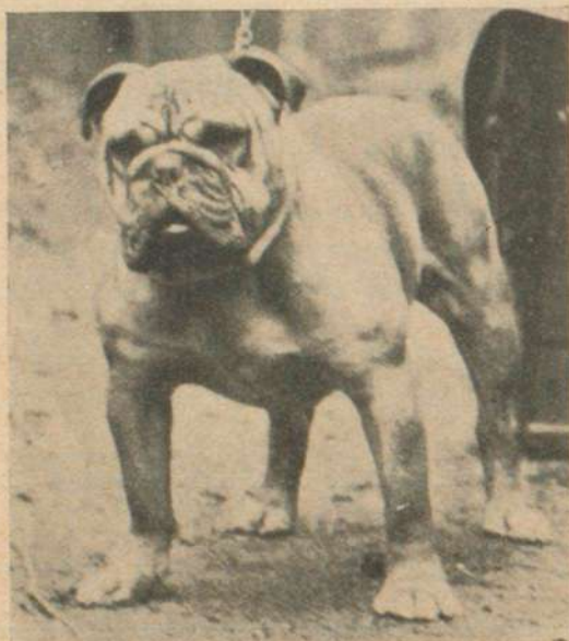
PICCADILLY PRIVATEER Reserve Winners M.K.A. Show, Montreal