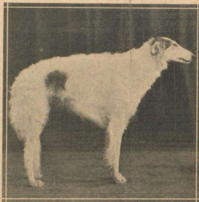
OSTRAND O' VALLEY FARM (C.K.C.S.B. 33801—A.K.C.S.B. 239743)