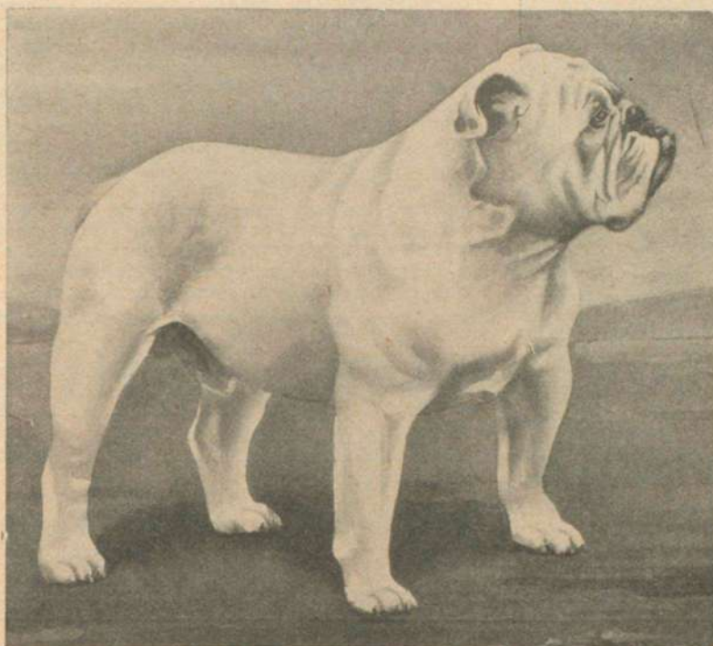
CH. KINGSWAY MAN-O'WAR (C.K.C.S.B. 25740)