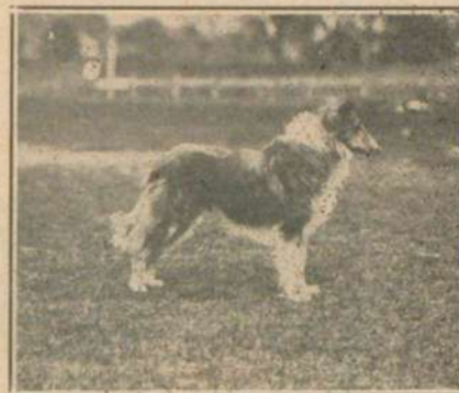
A Sample by The Mountaineer.

The Mountaineer Collies have made Continental history and the name of