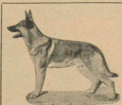
NOIR OF NORTH SHORE