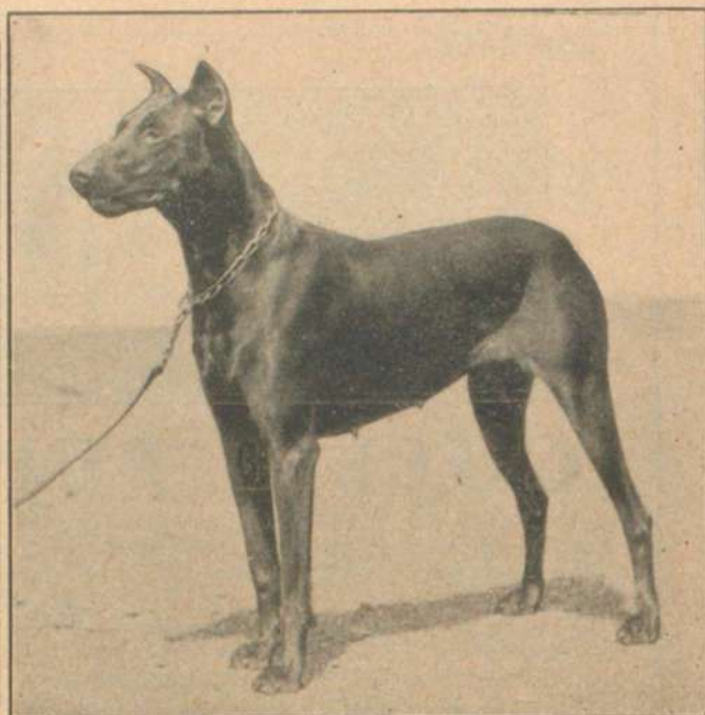
Int. Ch. Centa vom Rinkenbuehl.