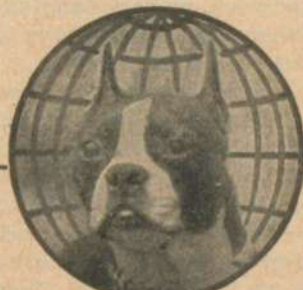
Head Study CH. GLOBE SWEET WILLIAM