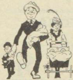
Us for the Dog Show at Moose Jaw.