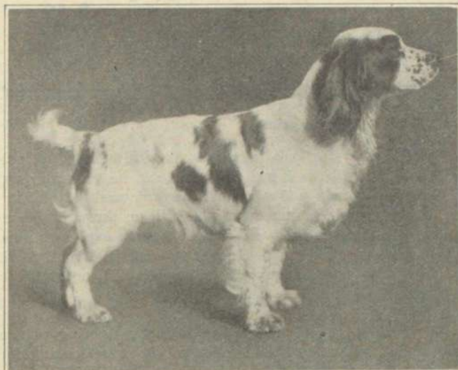
CHAMPION WALL'S GAYLORD

See recent show reports for the winnings of The Brampton Cocker at recent shows. We show our dogs fearlessly, and the dogs we sell are similar in all respects to those we show.