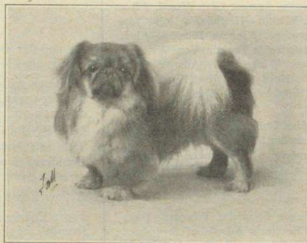
TAI FU OF HARTLEBURY

20 LAKE SHORE ROAD, MIMICO BEACH MIMICO, ONTARIO, CANADA