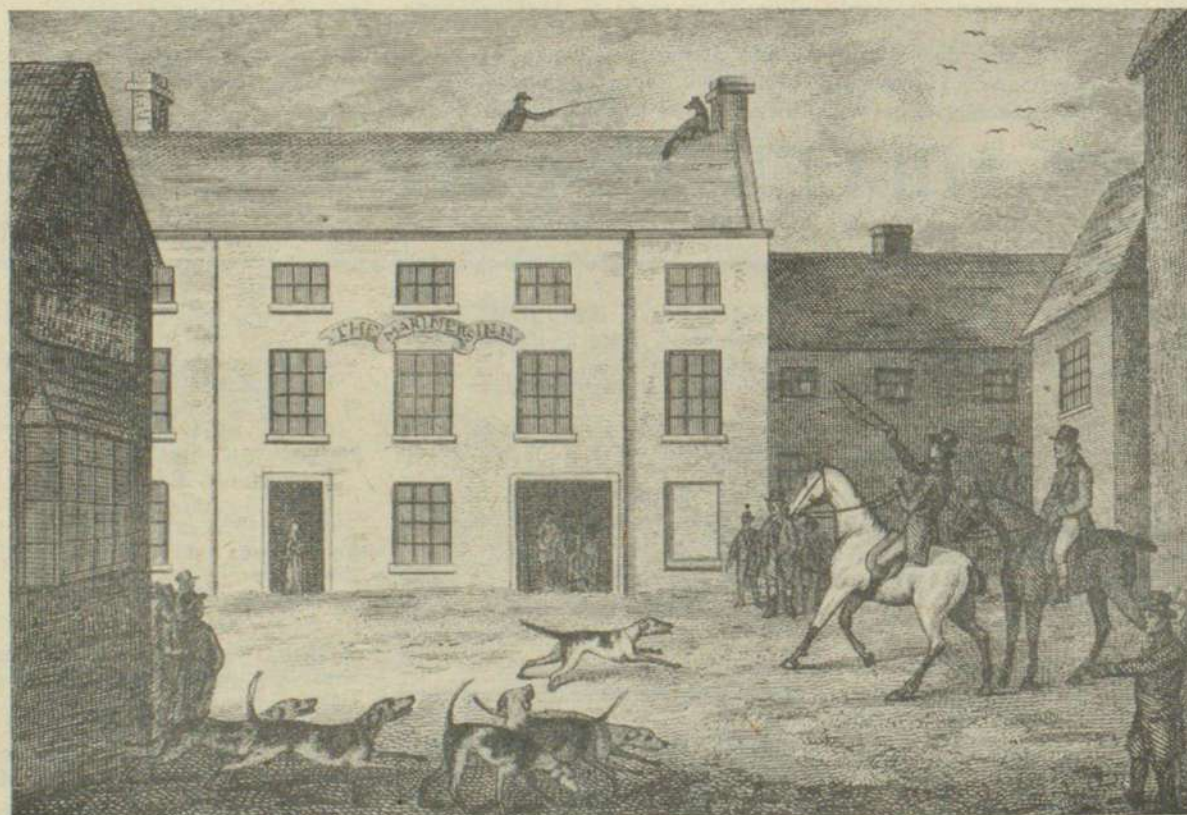
ALWAYS A SPORTING HOSTELRY.

So to hark back to the sentiment expressed in the first paragraph of this contribution, I want to let it be known that there is as much pleasure, delightful anticipation and "kick" in old and sporting print collecting, as there is in shooting and fishing. It is impossible to describe the thrill the searcher experiences when he finds something that is particularly pleasing in a personal way,