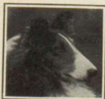
CHAMPION BELMOSS COUNTESS (C.K.C.S.B. 55612)