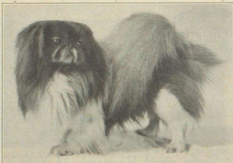
PUN CHU—A Great Peke and a Great Producer

T HESE dogs are winners of many firsts and cups at Championship shows and as sires are equally famous. Special low stud fee $10. Book your service in advance and avoid disappointment.