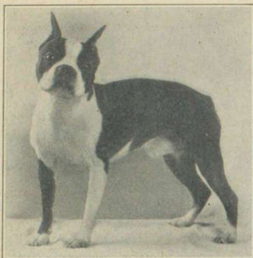
HIGHBALL'S LITTLE MAN