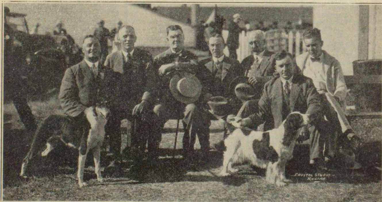
THE MEN BEHIND THE GUNS AT REGINA.