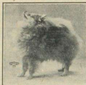
CHISWICK GOLD STAR, IMP. (C.K.C.S.B. 62591) From an unretouched photo.

CHISWICK GOLD STAR, IMP. (C.K.C.S.B. 62591)