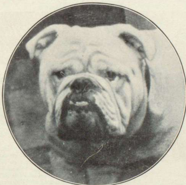
KIPPAX JOCK (IMP.) (C.K.C.S.B. 71698)