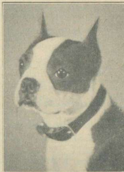
THE BURGLAR DEE CEE (C.K.C.S.B. 61155)