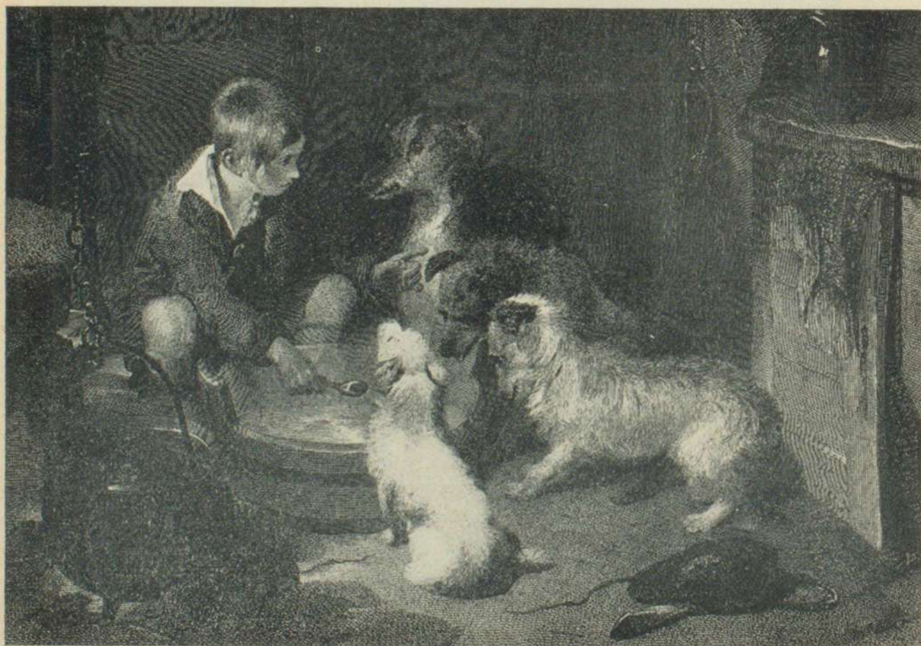
"THE BREAKFAST PARTY"

The interior or "den" of the earth would probably be twelve inches in height; and, even in such a place, a good many of our over 18 pounds (or less) terriers would have a deuce of a job to accomplish what he was sent in there to do, and that would be the driving out rather than the killing of the fox. So, to come to the point, there must be many who would prefer the smaller, shorter legged and longer bodied terriers for going to a fox—terriers not unlike the white, and the sandy and white colored, coarse and hard-coated terriers in Landseer's picture,