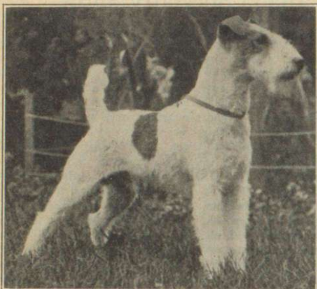
BECKSIDE BRILLIANT (IMP.)