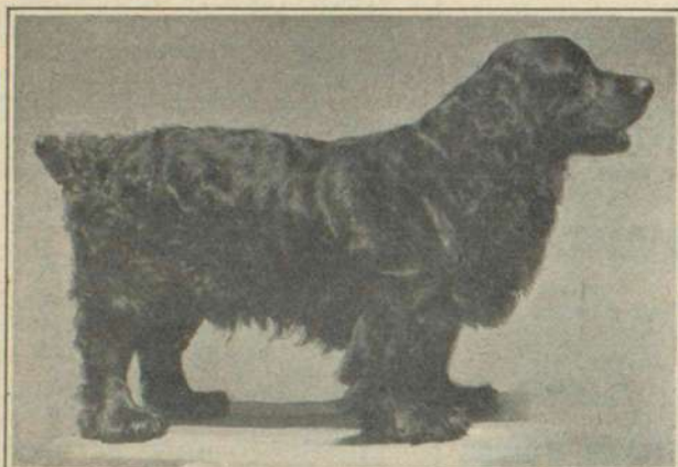
CHARMER OF WAR (C.K.C.S.B. 61954)

"HOME OF THE BETTER KIND OF COCKER SPANIELS"